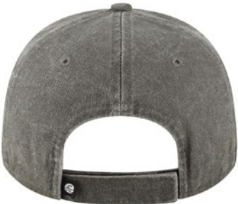
SHORT VELCRO CLOSURE

Unstructured low profile with a longer bill. 100% cotton twill cap with a pigment dyed wash. Pre-formed brim. 360 Pro-Stitch for a clean, classic look. Short velcro closure.