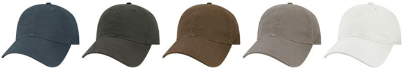
NAVY BLACK CIGAR DARK GREY WHITE