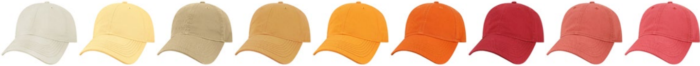
PUTTY BUTTER KHAKE OLD GOLD AUTUMN BLAZE BURNT ORANGE CARDINAL MARSALA NANTUCKET RED