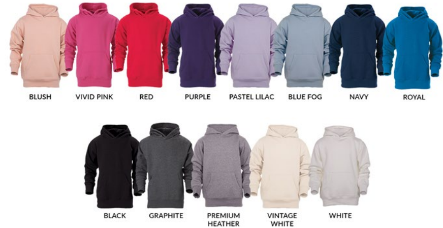
DESIGN # 7449-SP

65% Cotton / 35% Polyester, 288gsm/8.5oz. Durable and solid construction with a specialty wash for extra softness. Brushed interior for ultimate comfort. Double layer of fleece in the hood. Perfect fabric for all decoration techniques. Front pouch pocket. Available in Youth S-XL.