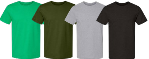
IRISH GREEN HEATHER MILITARY GREEN HEATHER HEATHER GREY BLACK HEATHER