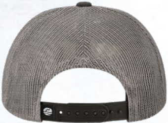
PLASTIC SNAP CLOSURE

Structured medium profile with 100% cotton twill front panels & brim. Slightly curved visor. Polyester mesh back with a plastic snap closure.