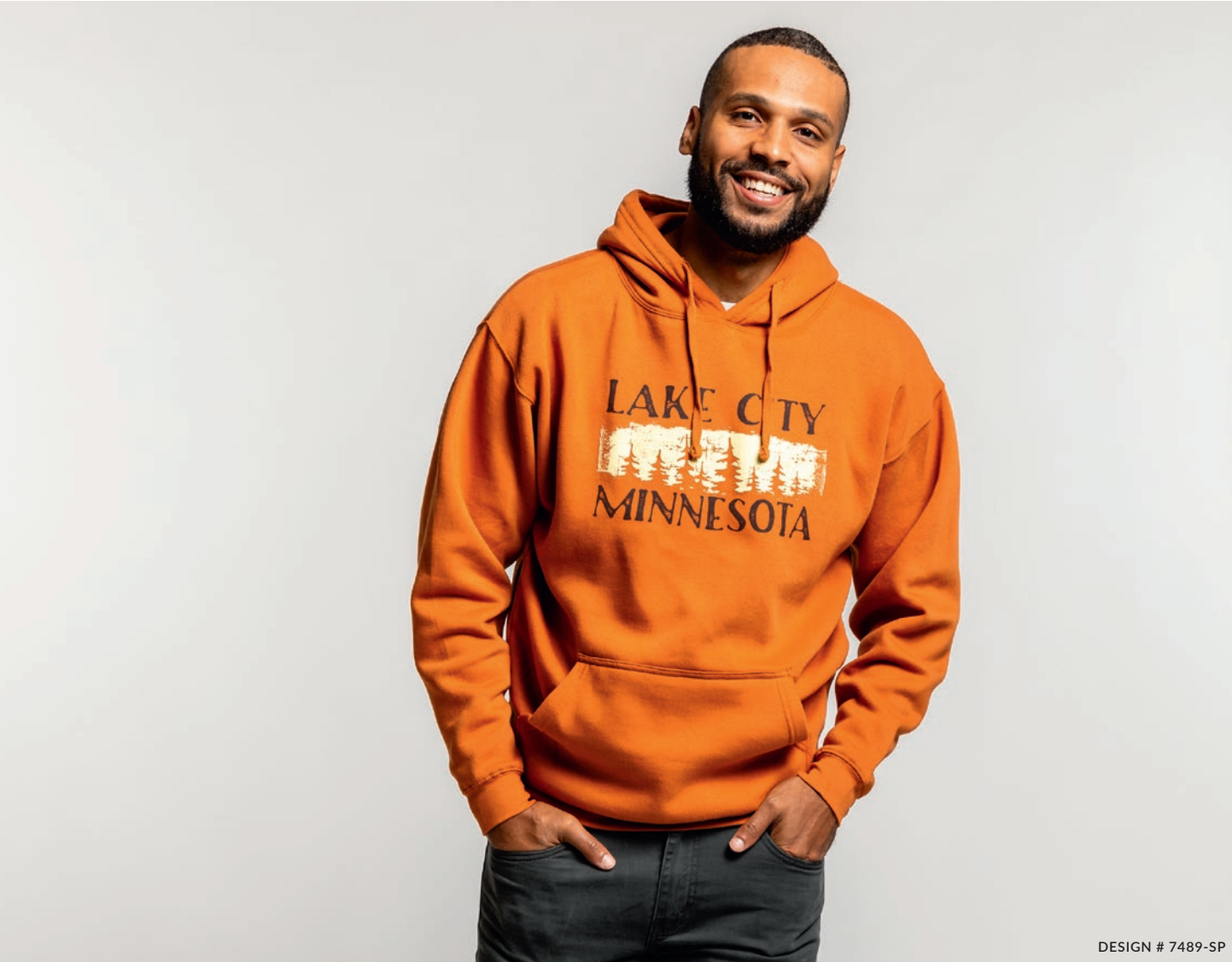
DESIGN # 7489-SP

65% Cotton / 35% Polyester, 288gsm/8.5oz. Durable and solid construction with a specialty wash for extra softness. Brushed interior for ultimate comfort. Double layer of fleece in the hood. Perfect fabric for all decoration techniques. Extra deep pouch pocket. Available in XS-XXL, select colors in XXXL*.