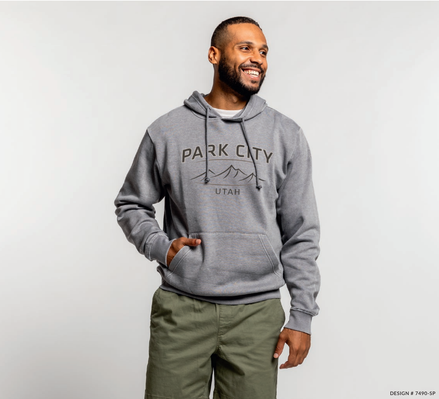
DESIGN # 7490-SP