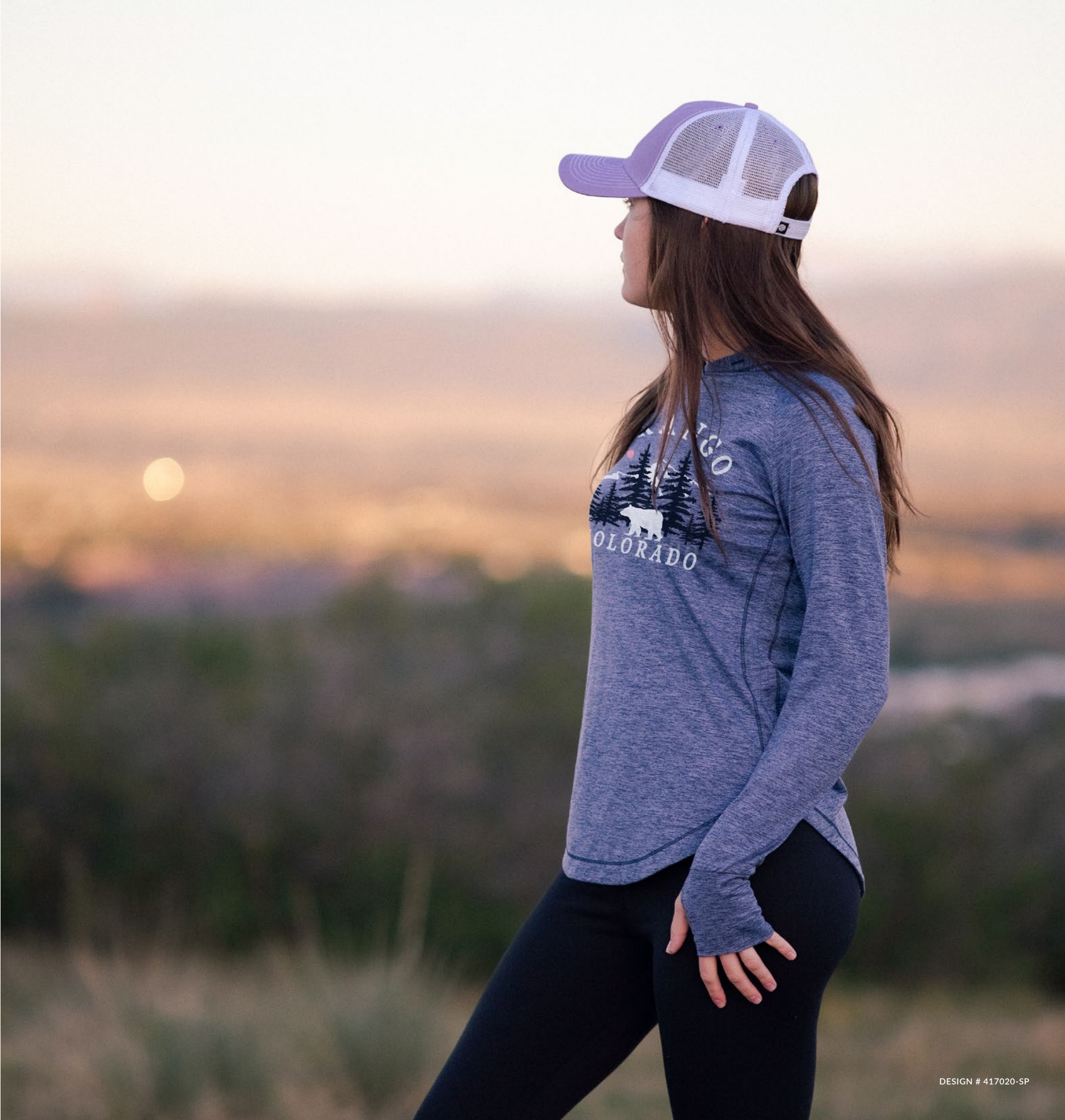
DESIGN # 417020-SP