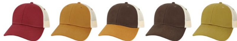
BURNT HENNA/ NATURAL

Structured medium profile with 100% cotton twill front panels & brim. Pre-curved visor with contrast stitching, eyelets, & brim. Soft polyester mesh back with a velcro closure.