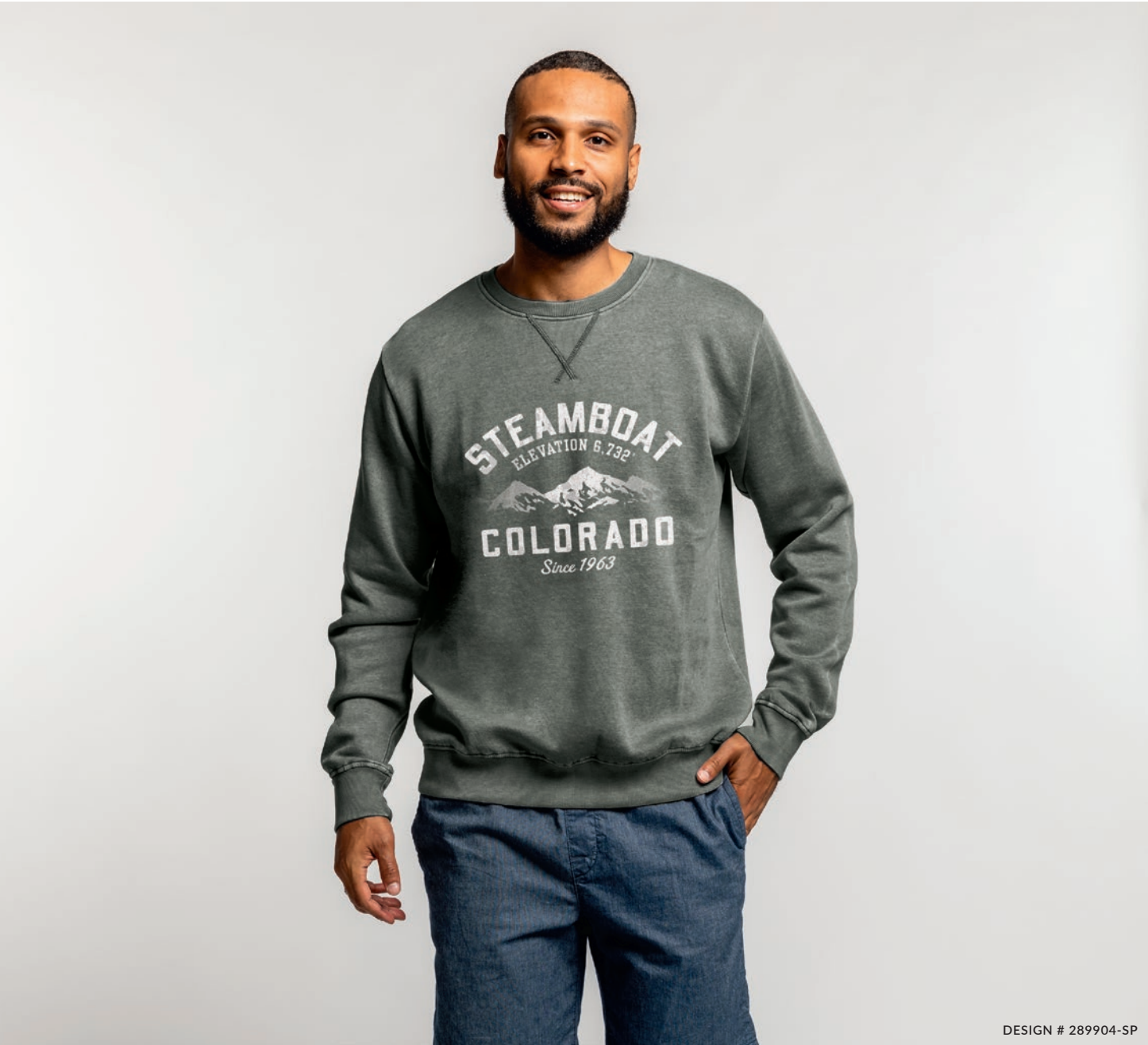
DESIGN # 289904-SP