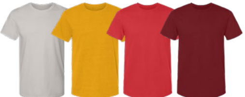
OATMEAL HEATHER MUSTARD HEATHER RED HEATHER DARK RED HEATHER

All colors are 60% Ringspun Cotton / 40% polyester, except Athletic Heather (90/10) and Oatmeal Heather (99/1). 30 singles face yarn, 4.5oz. Soft, lightweight, classic fit. Seamless 1x1 rib collar with two-needle coverstitching on front neck. Shoulder-to-shoulder taping. Two-needle hemmed sleeves and bottom. Most colors available in S-XXL; Black, Navy, Royal Heather, and Heather Grey are available in XXXL.