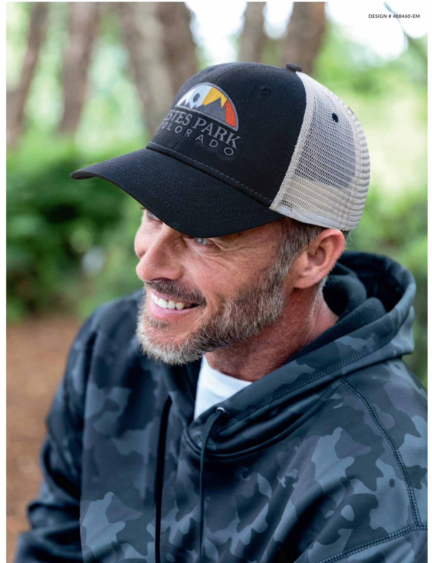
DESIGN # 408460-EM