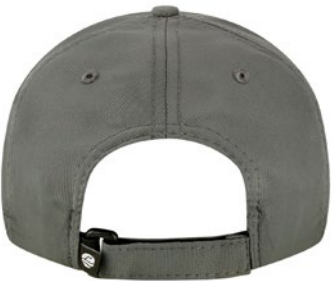
MICRO VELCRO CLOSURE WITH STRETCH LOOP

Unstructured low profile for a relaxed & comfortable fit. 100% polyester performance fabric is moisture wicking & quick drying. Cool-tech sweatband. Ultra lightweight - 33% lighter than the original Epic. Pre-curved visor. Micro velcro closure with a stretch loop.