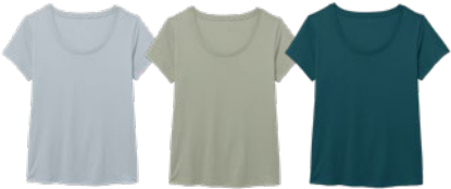
BLUE FOG DESERT SAGE OCEAN DEPTHS