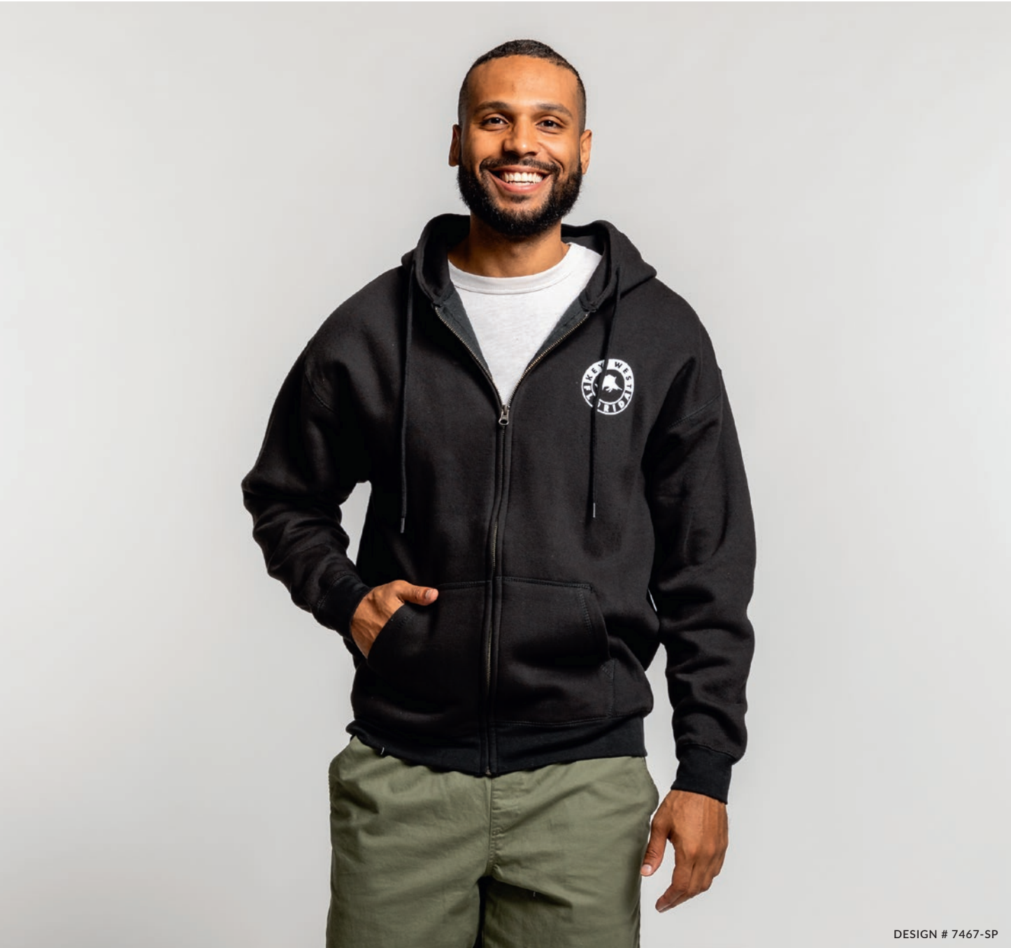
DESIGN # 7467-SP

65% Cotton / 35% Polyester, 288gsm/8.5oz. Durable and solid construction with a specialty wash for extra softness. Brushed interior for ultimate comfort. Double layer of fleece in the hood. Perfect fabric for all decoration techniques. Extra deep pouch pocket. Covered zipper for a clean, polished finish. Available in XS-XXL.