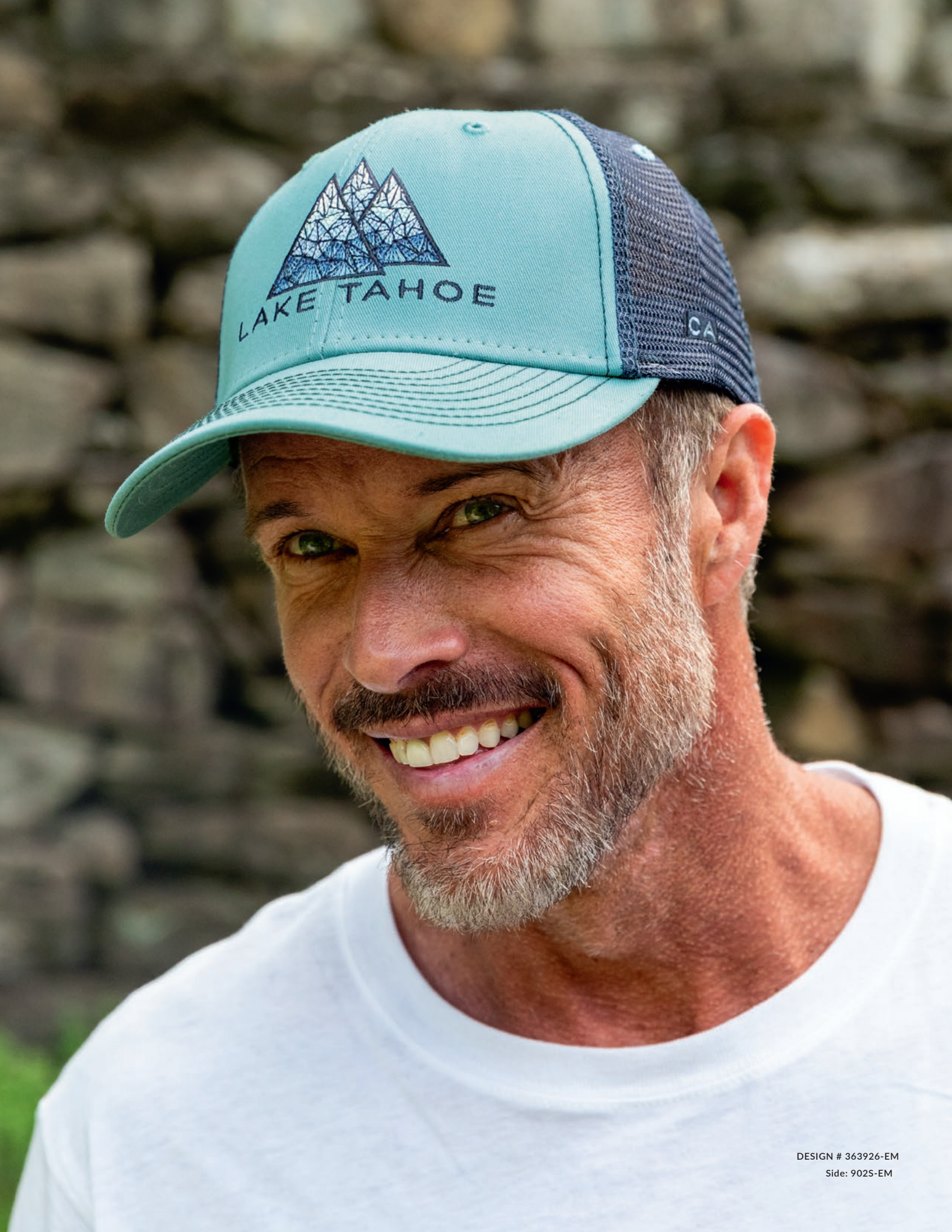
DESIGN # 363926-EM Side: 9025-EM