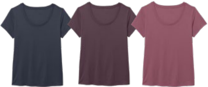
SPRING NAVY VINTAGE VIOLET HAWTHORN ROSE