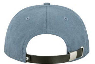
LEATHER METAL CLASP CLOSURE

Structured medium profile. 100% Cotton Twill with a brushed soft hand feel. 5 panel cap with a seamless front panel & internal mesh stay. Perfect for patches. Braided cord at visor. Flat brim. Leather metal clasp closure.