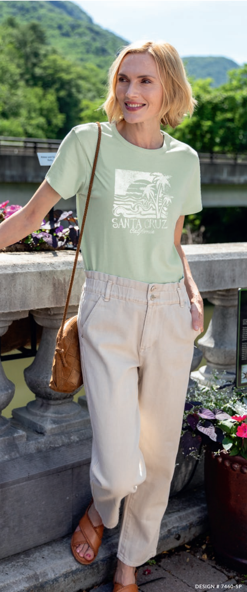
DESIGN # 7460-SP

50% Cotton / 50% Polyester, 140gsm/4.8oz. Classic Oatmeal is 99/1, 150gsm/4.8oz. Soft to the touch, hangs nicely without clinging. Classic crew neck styling. Pre-shrunk cotton helps preserve fit. Available in S-XXL.