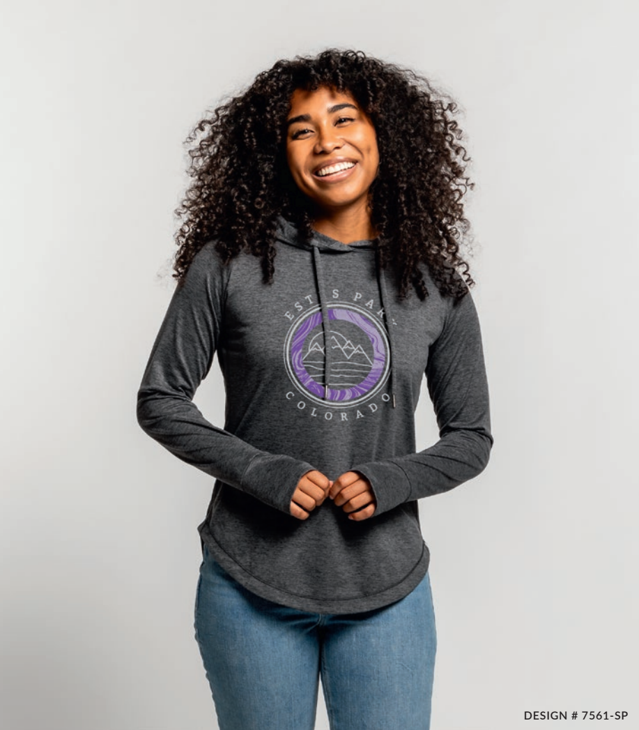
DESIGN # 7561-SP

92% Polyester / 8% Spandex, 220gsm/6.4oz.