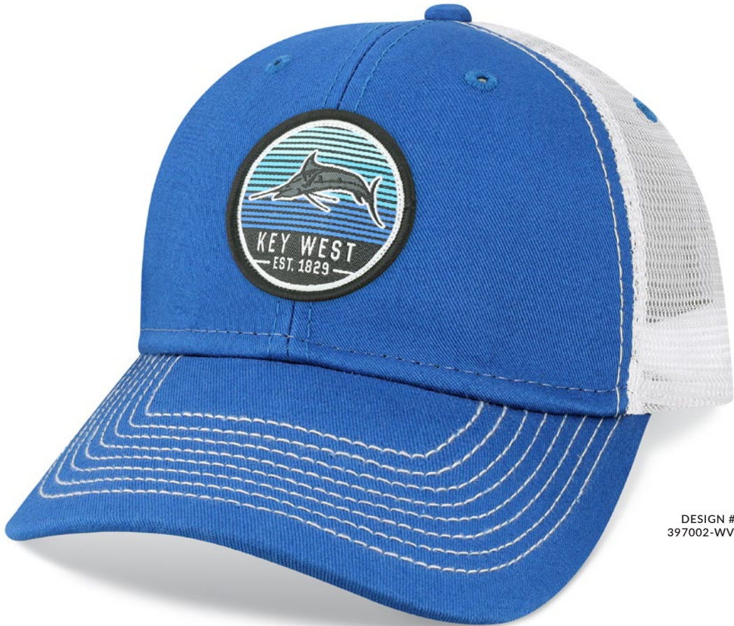
DESIGN # 397002-WVCP

Structured medium profile with 100% cotton twill front panels & brim. Pre-curved visor with contrast stitching, eyelets, & brim. Polyester mesh back with a plastic snap closure.