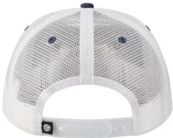
PLASTIC SNAP CLOSURE

Structured medium profile with 100% cotton twill front panels & brim. Pre-curved visor with contrast stitching, eyelets, & brim. Polyester mesh back with a plastic snap closure.