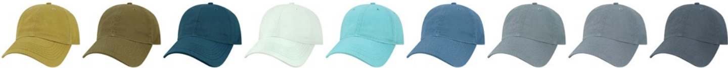
GREEN MOSS LODAN BALTIC PURE WATER TURQUOISE TONIC DAYLIGHT BLUE HARBOR STEEL INDIGO