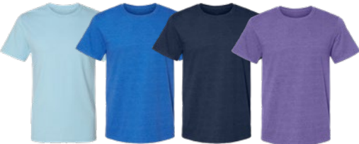
CLOUD HEATHER ROYAL HEATHER NAVY HEATHER PURPLE HEATHER