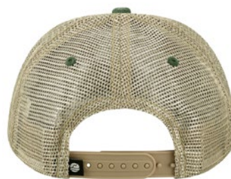
PLASTIC SNAP CLOSURE

Unstructured low profile mesh cap with a slightly longer brim. 100% dirty wash cotton twill front panels & brim creates rich, distinctive color. Vintage polyester soft mesh back. Contrast stitching matches mesh. Pre-curved visor & plastic snap closure.