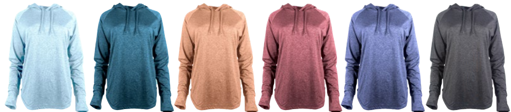
NEW QUIET TIDE HEATHER

Athletic trim with a cozy, oversized hood. Advanced moisture management fabric technology wicks perspiration from the skin. Designed to perform in all weather conditions. Sun protection of UPF 30+. Raglan sleeves for ultimate range of motion. Longer back for an athletic and comfortable fit. Thumbholes at sleeves for added comfort & warmth. Available in S-XXL.