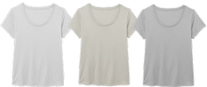
WHITE CLASSIC OATMEAL STEEL GREY

50% Cotton / 50% Polyester, 140gsm/4.8oz. Classic Oatmeal is 99/1, 150gsm/4.8oz. Soft to the touch, hangs nicely without clinging. Pre-shrunk cotton helps preserve fit. Available in S-XXL.