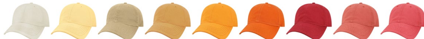
PUTTY BUTTER KHAKI OLD GOLD AUTUMN BLAZE BURNT ORANGE CARDINAL MARSALA NANTUCKET RED