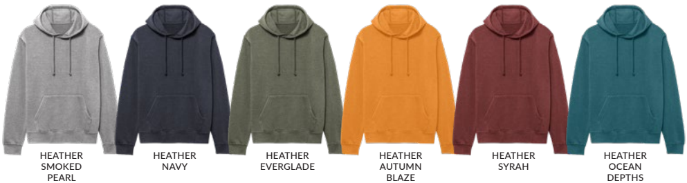
HEATHER SMOKED PEARL

57% Cotton / 43% Polyester, 220gsm/8oz. A must-feel, luxurious finish. Lightweight, breathable fleece, cloud-like softness, brushed interior and a burnout process to give it a vintage feel. Generous hood & front pocket. Relaxed fit for ultimate comfort. Available in S-XXL.