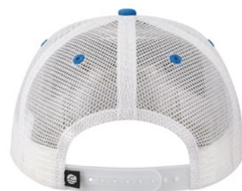
PLASTIC SNAP CLOSURE

Structured medium profile with 100% cotton twill front panels & brim. Pre-curved visor with contrast stitching, eyelets, & brim. Polyester mesh back with a plastic snap closure.