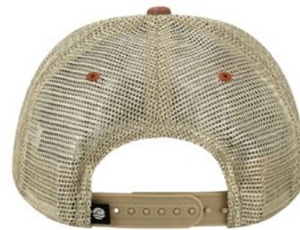
PLASTIC SNAP CLOSURE

Unstructured low profile mesh cap with a slightly longer brim. 100% dirty wash cotton twill front panels & brim creates rich, distinctive color. Vintage polyester soft mesh back. Contrast stitching matches mesh. Pre-curved visor & plastic snap closure.