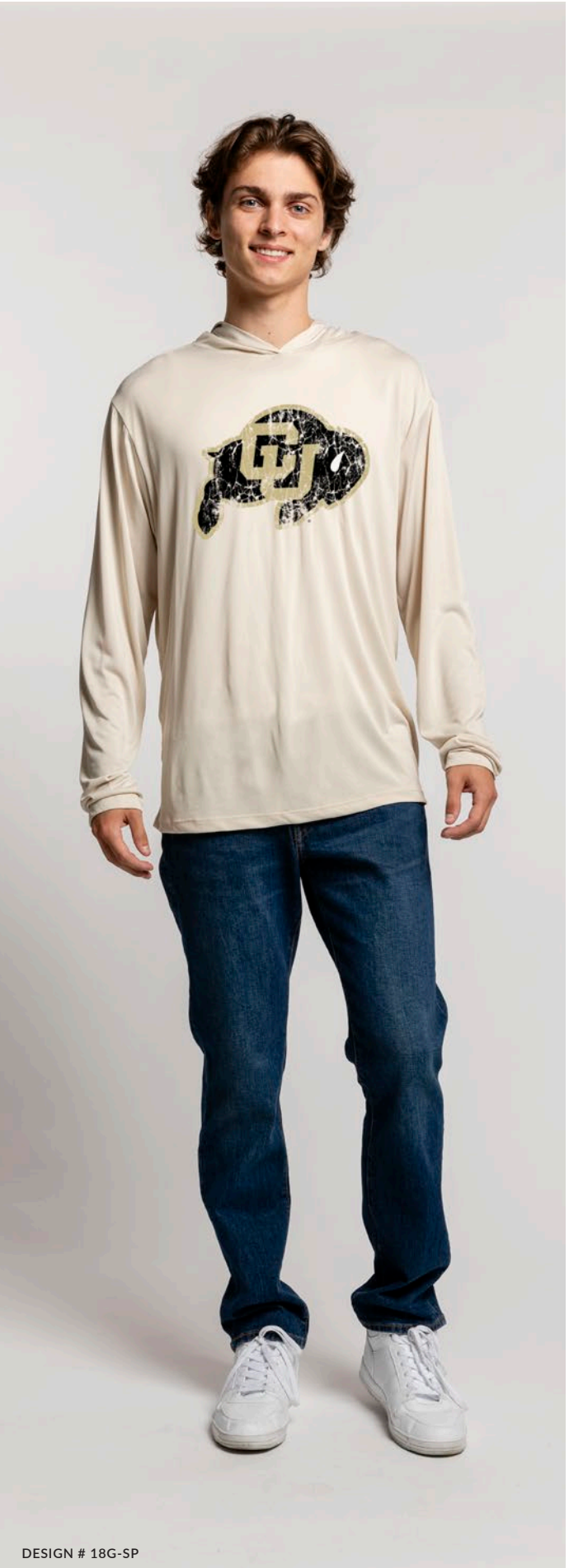
DESIGN # 18G-SP