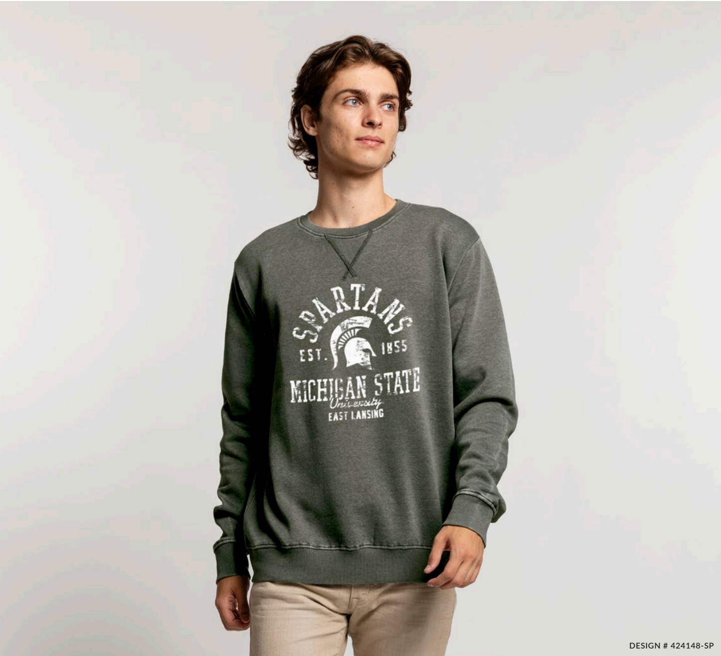
DESIGN # 424148-SP