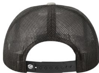
PLASTIC SNAP CLOSURE

Structured medium profile with 100% cotton twill front panels & brim. Slightly curved visor. Polyester mesh back with a plastic snap closure.