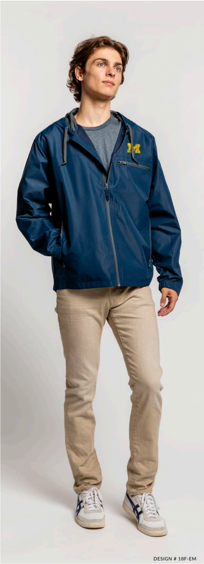
DESIGN # 18F-EM