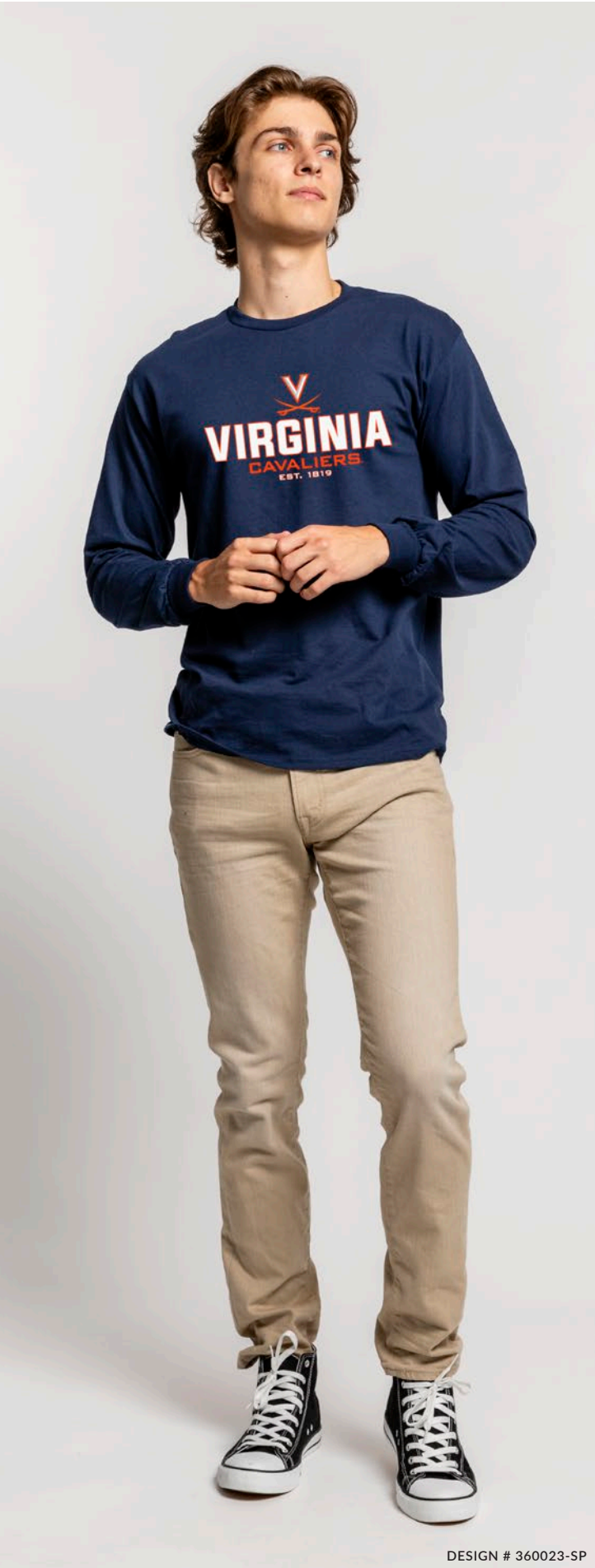
DESIGN # 360023-SP