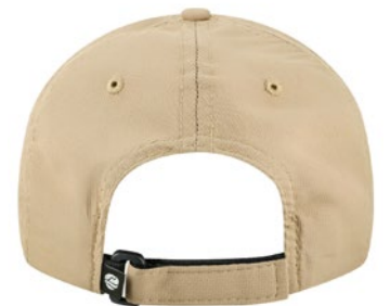
MICRO VELCRO CLOSURE WITH STRETCH LOOP

Unstructured low profile for a relaxed & comfortable fit. 100% polyester performance fabric is moisture wicking & quick drying. Cool-tech sweatband. Ultra lightweight - 33% lighter than the original Epic. Pre-curved visor. Micro velcro closure with a stretch loop.