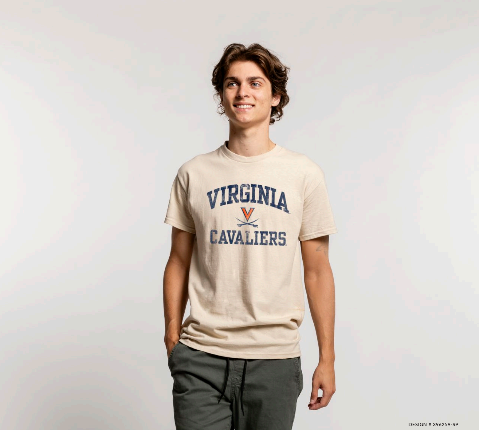
DESIGN # 396259-SP