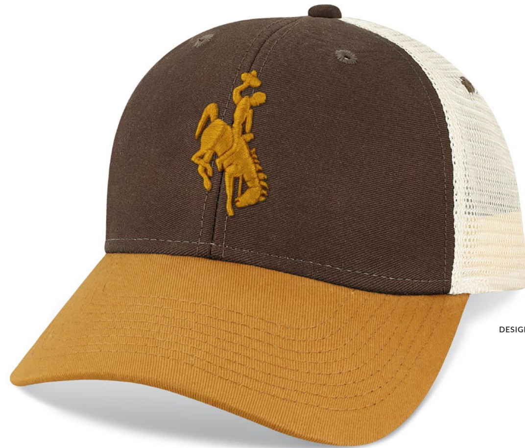
DESIGN # 18B-EO