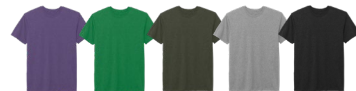
PURPLE HEATHER IRISH GREEN HEATHER MILITARY GREEN HEATHER HEATHER GREY* BLACK HEATHER*