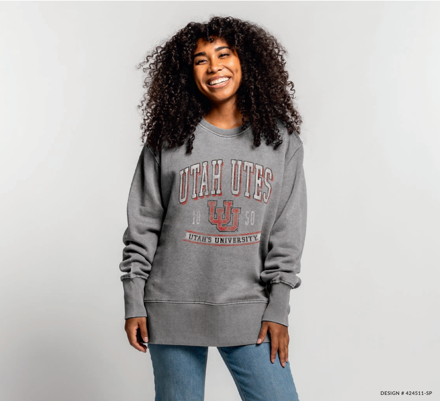
DESIGN # 424511-SP