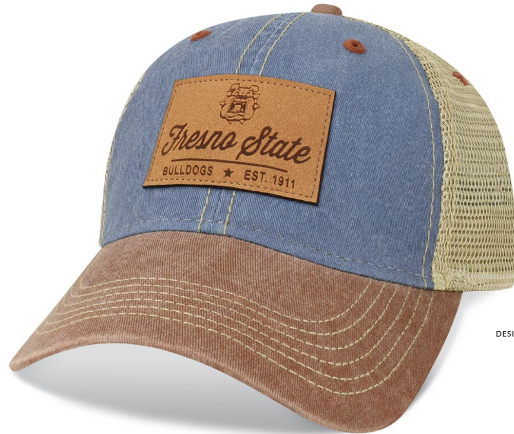
DESIGN # 537B-MIS