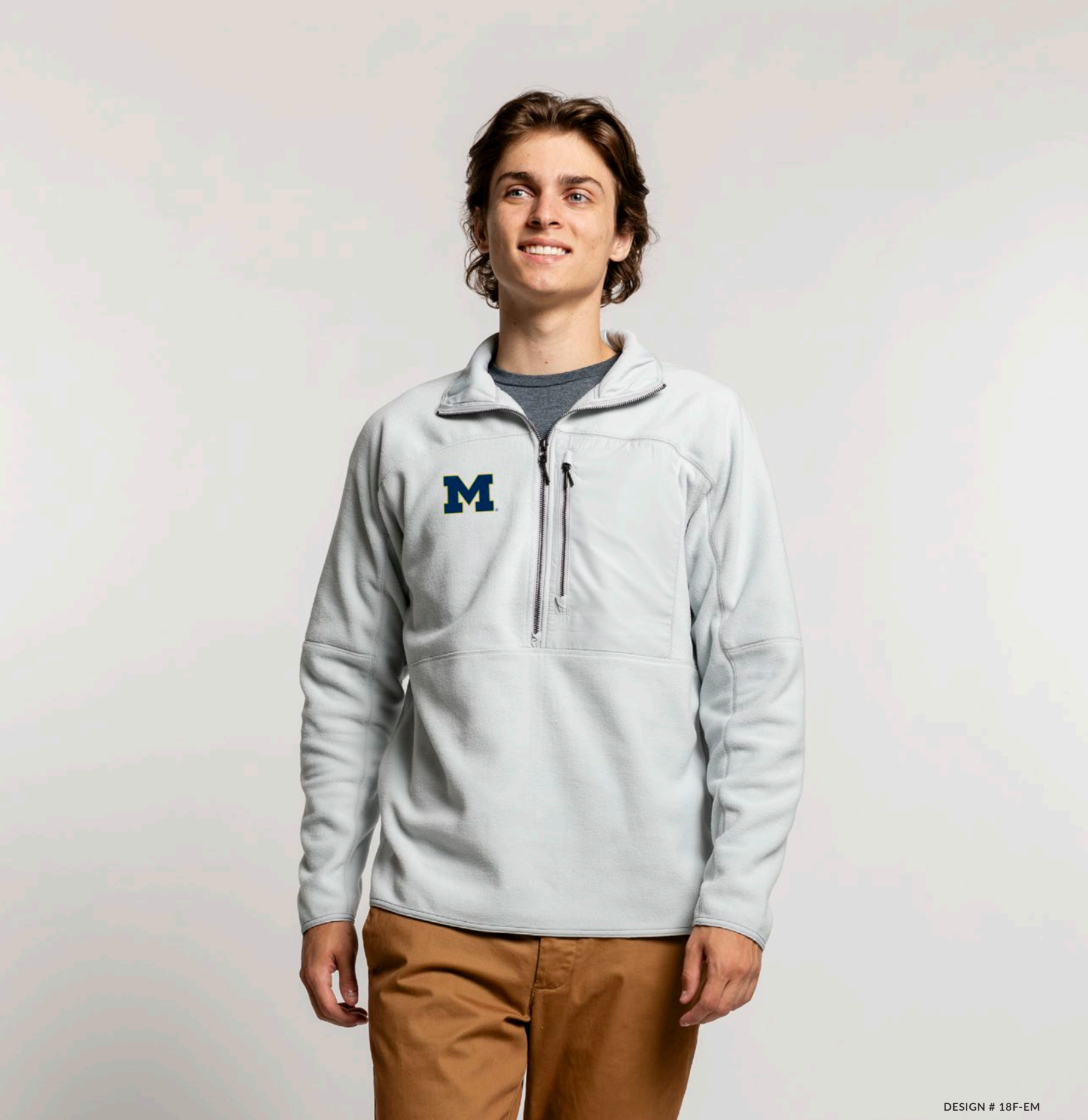
DESIGN # 18F-EM

100% Brushed Polyester Fleece, 200gsm/5.9oz. Stand-up collar for protection against the elements. Half zip allows for quick temperature control. Zippered chest pocket for valuables. Available in S-XXL.