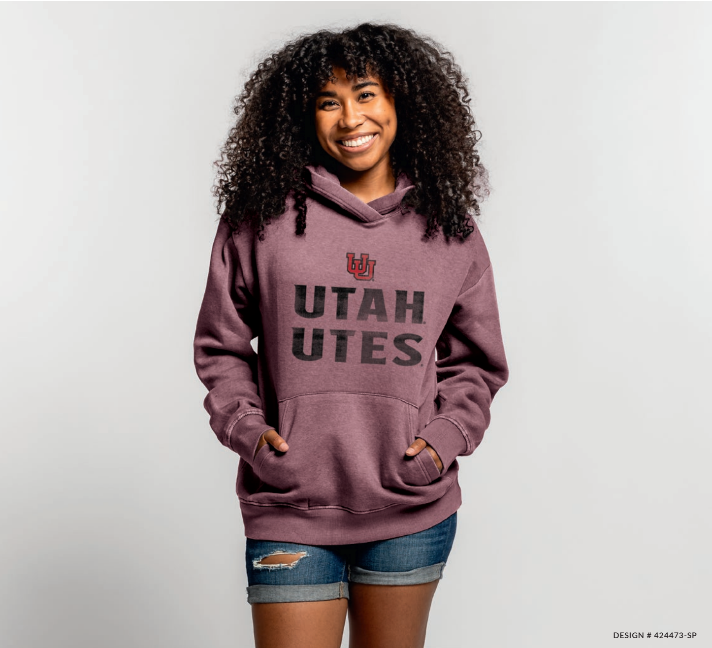
DESIGN # 424473-SP