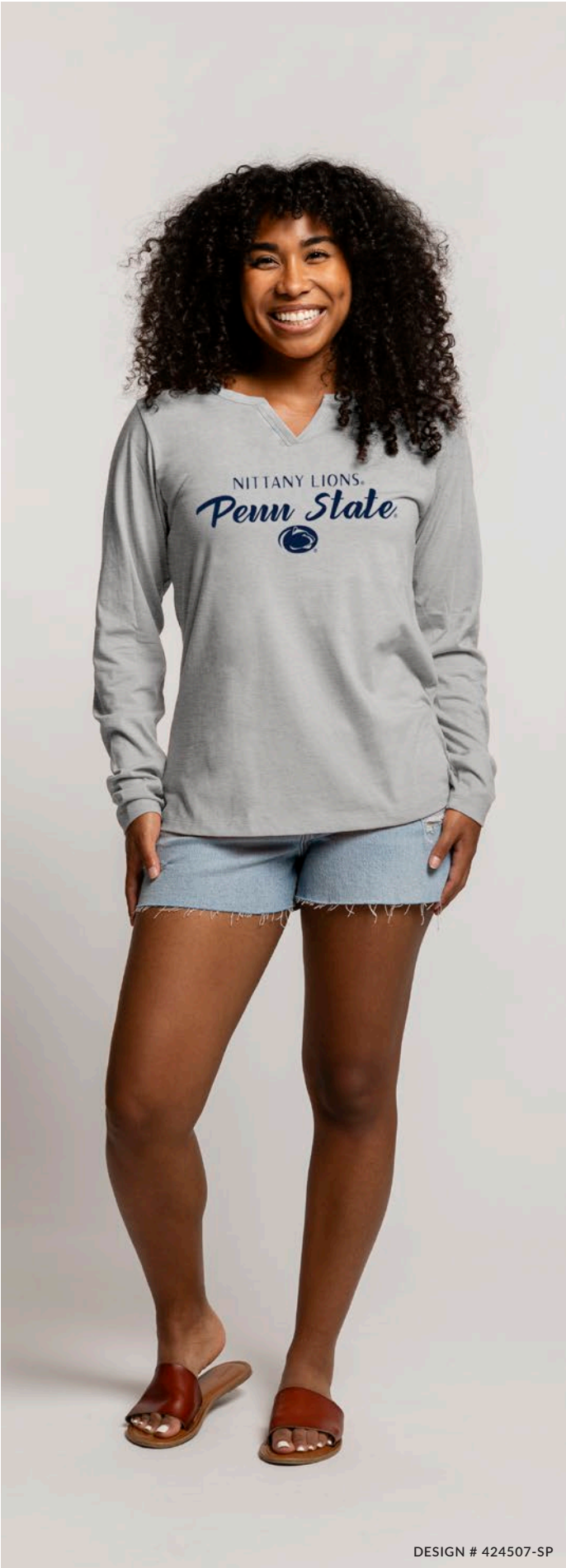
DESIGN # 424507-SP