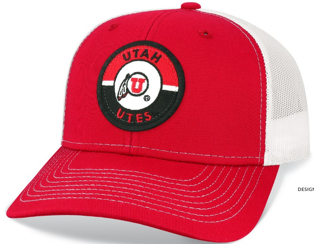
DESIGN # 548B-CPF