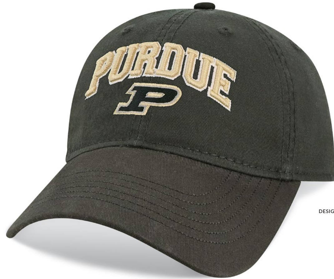
DESIGN # 24-EO