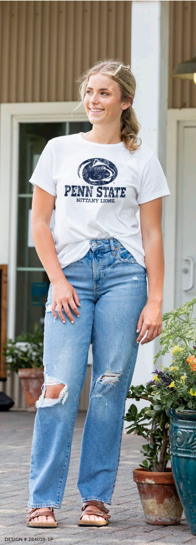
DESIGN # 284038-SP

50% Cotton / 50% Polyester, 140gsm/4.8oz. Classic Oatmeal is 99/1, 150gsm/4.8oz. Soft to the touch, hangs nicely without clinging. Classic crew neck styling. Pre-shrunk cotton helps preserve fit. Available in S-XXL.