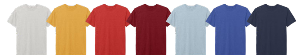
OATMEAL HEATHER MUSTARD HEATHER RED HEATHER DARK RED HEATHER CLOUD HEATHER ROYAL HEATHER* NAVY HEATHER*

All colors are 60% Ringspun Cotton / 40% polyester, except Heather Grey (90/10) and Oatmeal Heather (99/1). 30 singles face yarn, 4.5oz. Soft, lightweight, classic fit. Seamless 1x1 rib collar with two-needle coverstitching on front neck. Shoulder-to-shoulder taping. Two-needle hemmed sleeves and bottom. Most colors available in S-XXL; Black, Navy, and Royal Heather and Heather Grey are available in XXXL*.