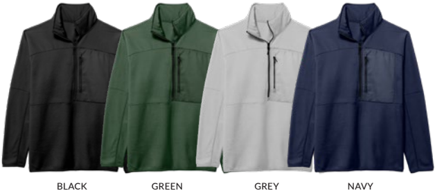
BLACK GREEN GREY NAVY

100% Brushed Polyester Fleece, 200gsm/5.9oz. Stand-up collar for protection against the elements. Half zip allows for quick temperature control. Zippered chest pocket for valuables. Available in S-XXL.