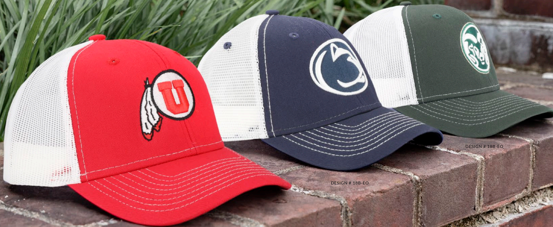
DESIGN # 18A-EO