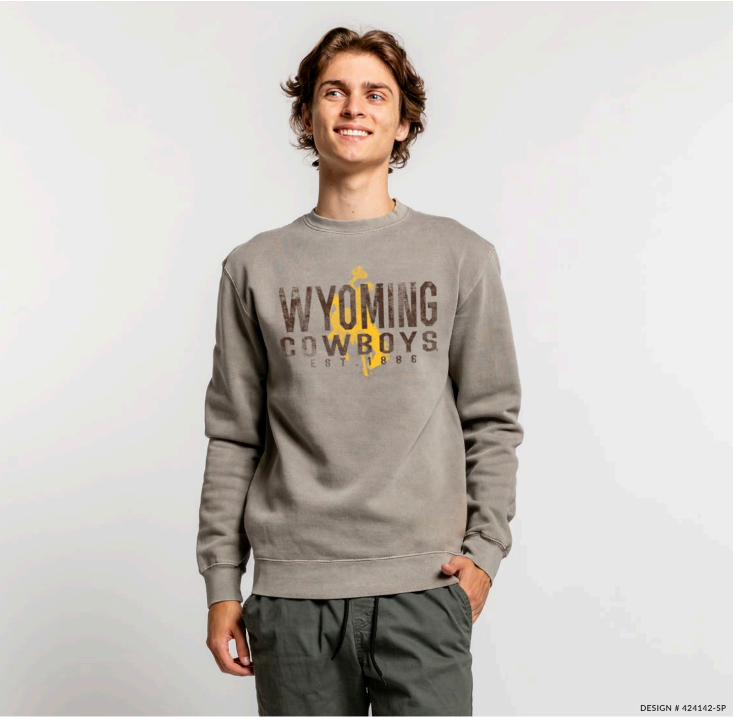
DESIGN # 424142-SP

60% Cotton / 40% Polyester, Ring Spun, Pigment Dyed Fleece – 305gsm/9oz. Garment dyed with a pigment wash for a worn-in look. Classic crew neck styling. Available in S-XXL.