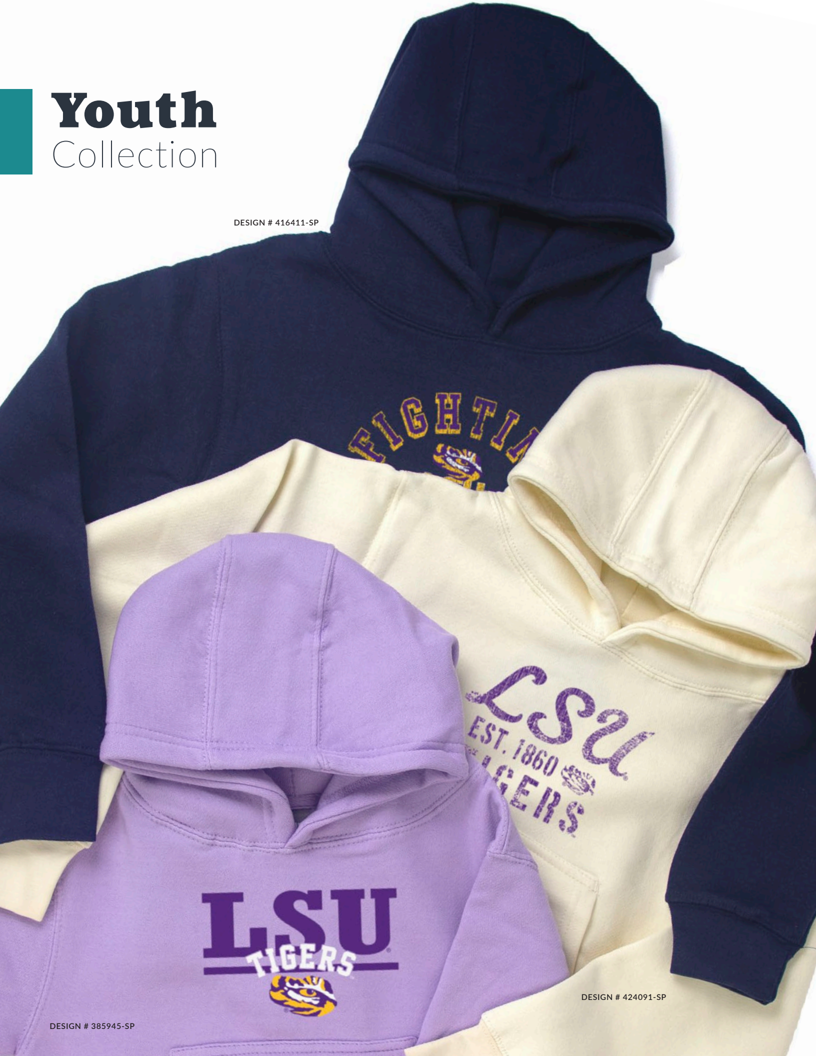
DESIGN # 416411-SP