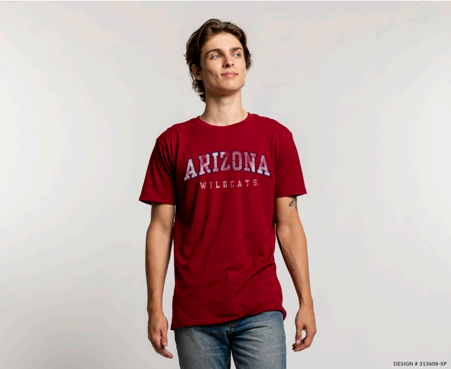
DESIGN # 313608-SP

100% Cotton, 170gsm/5oz. Garment dyed with a pigment wash for a worn-in look & incredible softness. Classic crew neck styling. Taped shoulder seams & double needle cover stitching at neck add comfort & durability. Available in S-XXL.