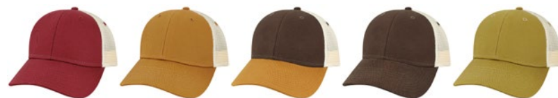
BURNT HENNA/ NATURAL

Structured medium profile with 100% cotton twill front panels & brim. Pre-curved visor with contrast stitching, eyelets, & brim. Soft polyester mesh back with a velcro closure.