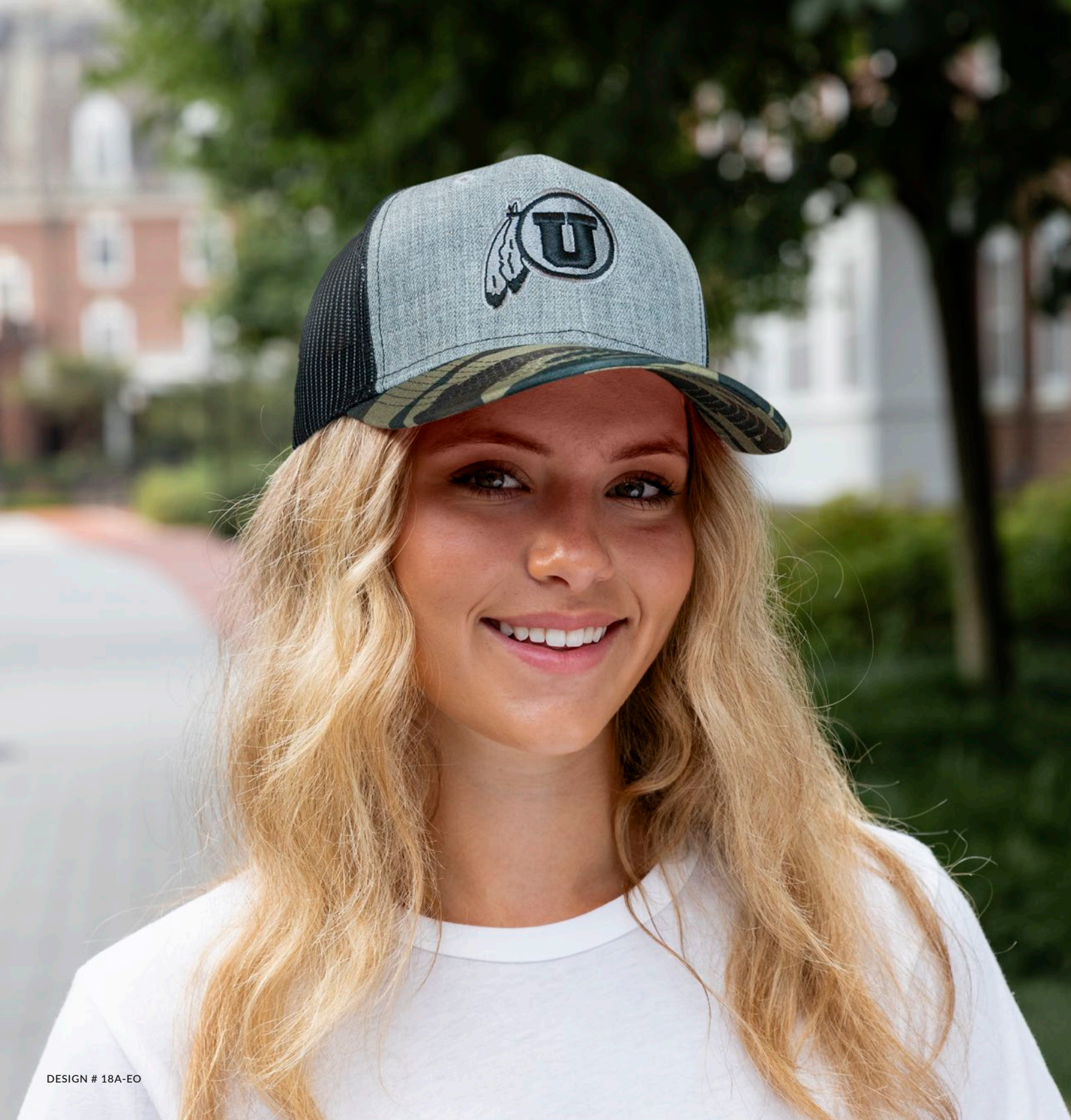
DESIGN # 18A-EO