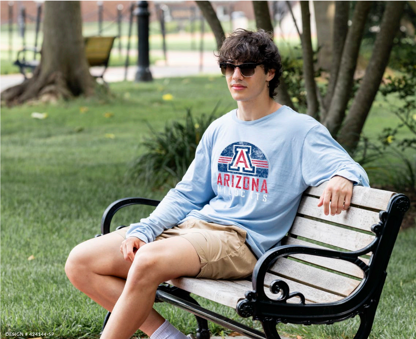
DESIGN # 424144-SP

100% Cotton, 170gsm/5oz. Garment dyed with a pigment wash for a worn-in look & incredible softness. Full length sleeves for added sun protection. Classic crew neck styling. Taped shoulder seams & double needle cover stitching at neck add comfort & durability. Available in S-XXL.