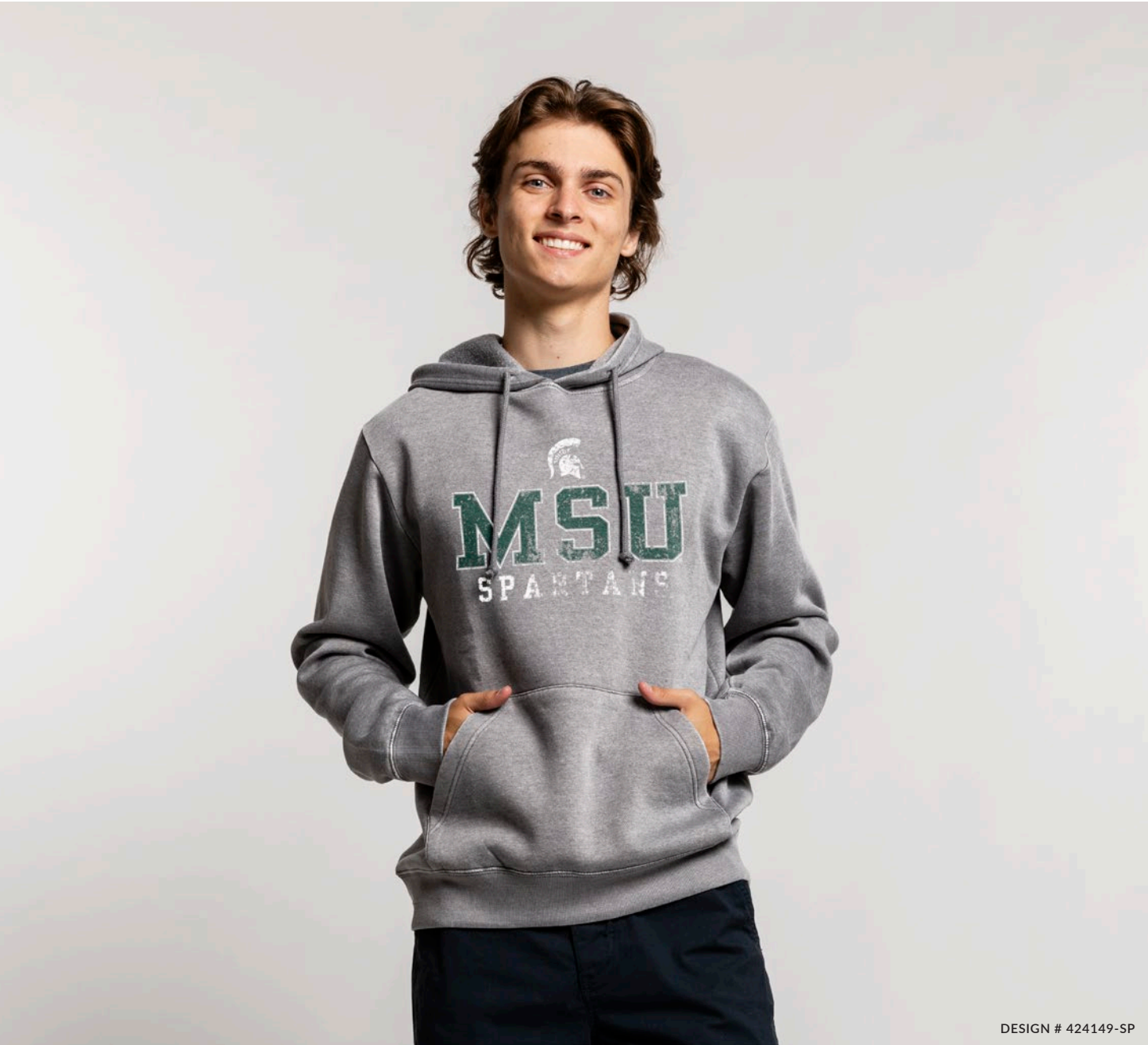
DESIGN # 424149-SP