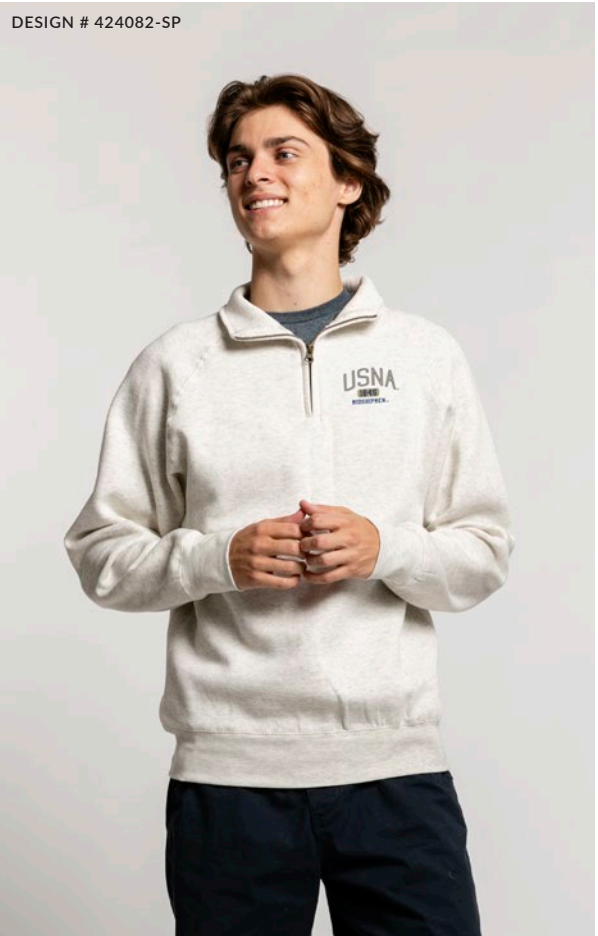
DESIGN # 424082-SP

65% Cotton / 35% Polyester, 288gsm/8.5oz. Durable and solid construction with a specialty wash for extra softness. Brushed interior for ultimate comfort. Perfect fabric for all decoration techniques. Athletic stand-up collar with covered zipper for a clean, polished finish. Offset side seams wrap to front for tapered shape. Raglan sleeves for improved mobility. Available in XS-XXL.