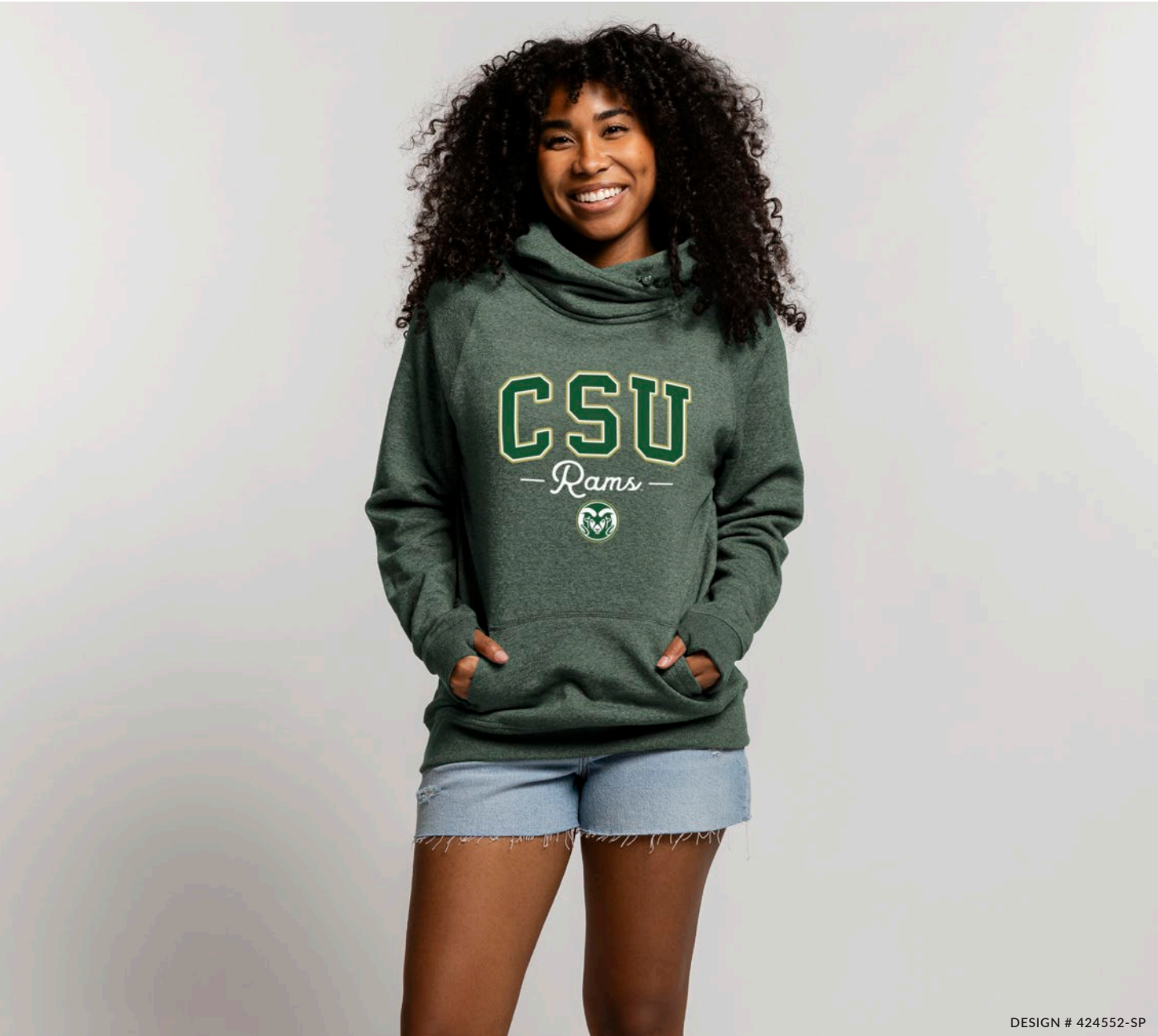
DESIGN # 424552-SP