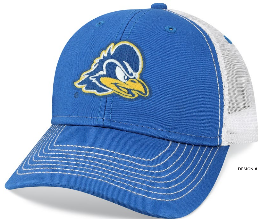
DESIGN # 18B-EM