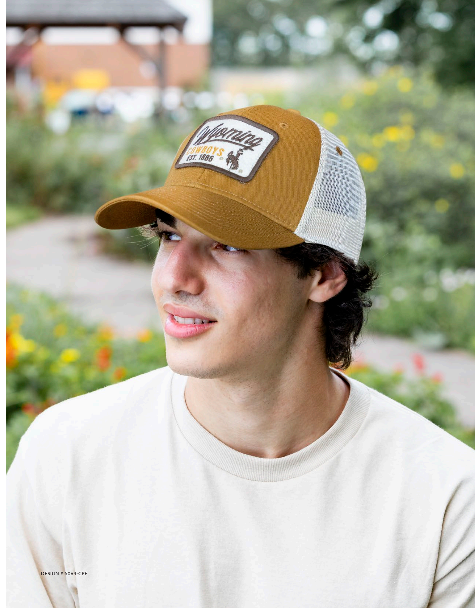
DESIGN # 5064-CPF