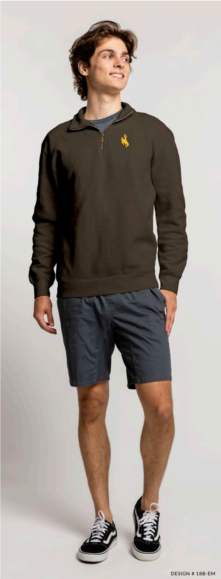
DESIGN # 18B-EM

60% Cotton / 40% Polyester, Ring Spun, Pigment Dyed Fleece, 305gsm/9oz. Garment dyed with a pigment wash for a worn-in look. Relaxed collar with exposed, antique brass zipper. Available in S-XXL.