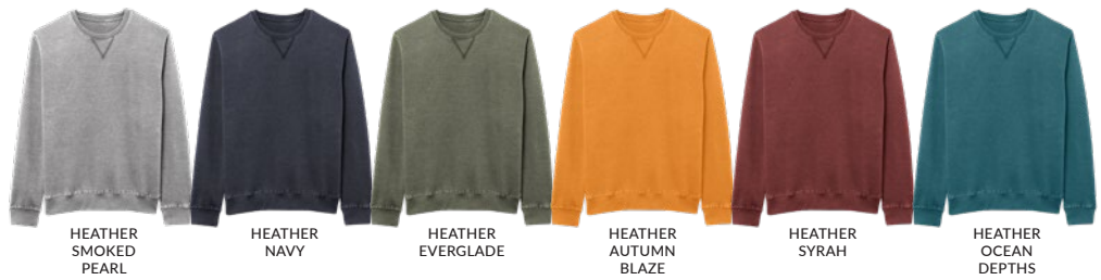
HEATHER SMOKED PEARL

57% Cotton / 43% Polyester, 220gsm/8oz. A must-feel, luxurious finish. Lightweight, breathable fleece, cloud-like softness, brushed interior and a burnout process to give it a vintage feel. V-Stitching at neck for added visual interest. Relaxed fit for ultimate comfort. Available in S-XXL.