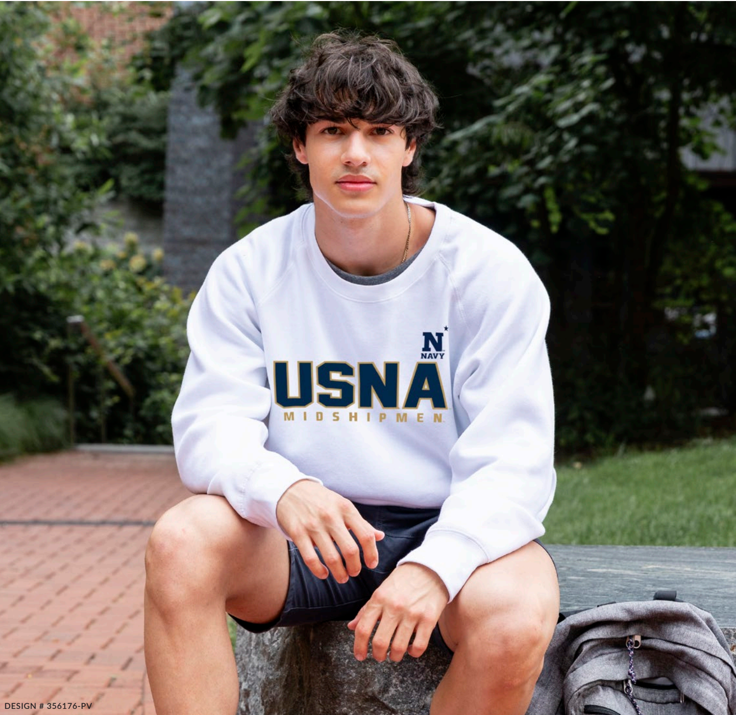
DESIGN # 356176-PV

65% Cotton / 35% Polyester, 288gsm/8.5oz. Durable and solid construction with a specialty wash for extra softness. Brushed interior for ultimate comfort. Perfect fabric for all decoration techniques. Available in XS-XXL, select colors in XXXL*.