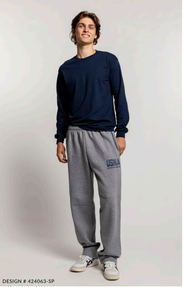
DESIGN # 424063-SP