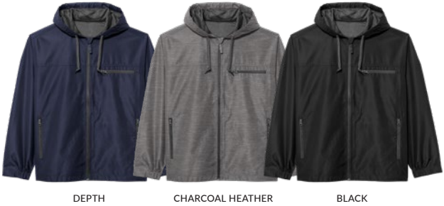
DEPTH CHARCOAL HEATHER BLACK

100% Polyester, 66gsm/1.9oz. Charcoal Heather is 72 gsm/2.1oz. Water resistant fabric with Durable Water Repellent (DWR) finish. Generously cut, 3-panel hood. Wind resistant zippers for ultimate protection against the elements. Mesh-lined hood and back yoke for better moisture management. Jacket packs neatly into left hand pocket for carrying convenience. Available in S-XXL.