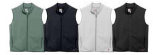
SPRUCE WASHED DARK NAVY MODERN GREY VINTAGE BLACK

Size Range: S-M-L-XL-2XL Design: 4233-SP