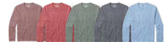
MAROON TRUE CARDINAL HUNTER FALL NAVY POWER BLUE

Size Range: S-M-L-XL-2XL Design: 7098-SP