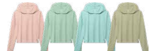
PINKS SANDS PALE MINT SURF BLUE SAGE

Size Range: S-M-L-XL Design: G18 / 09A-SP