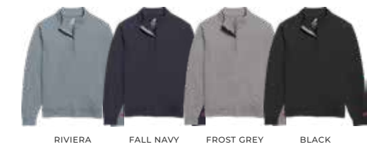
ALL DAY 1/4 ZIP ADM150 Design: 6514-SP