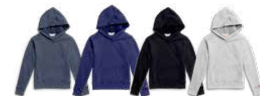
DENIM ROYAL BLUE NAVY CLASSIC OXFORD