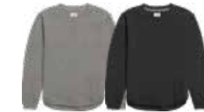
FALL HEATHER HTR ONYX