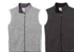
NIMBUS GREY CHARCOAL GREY