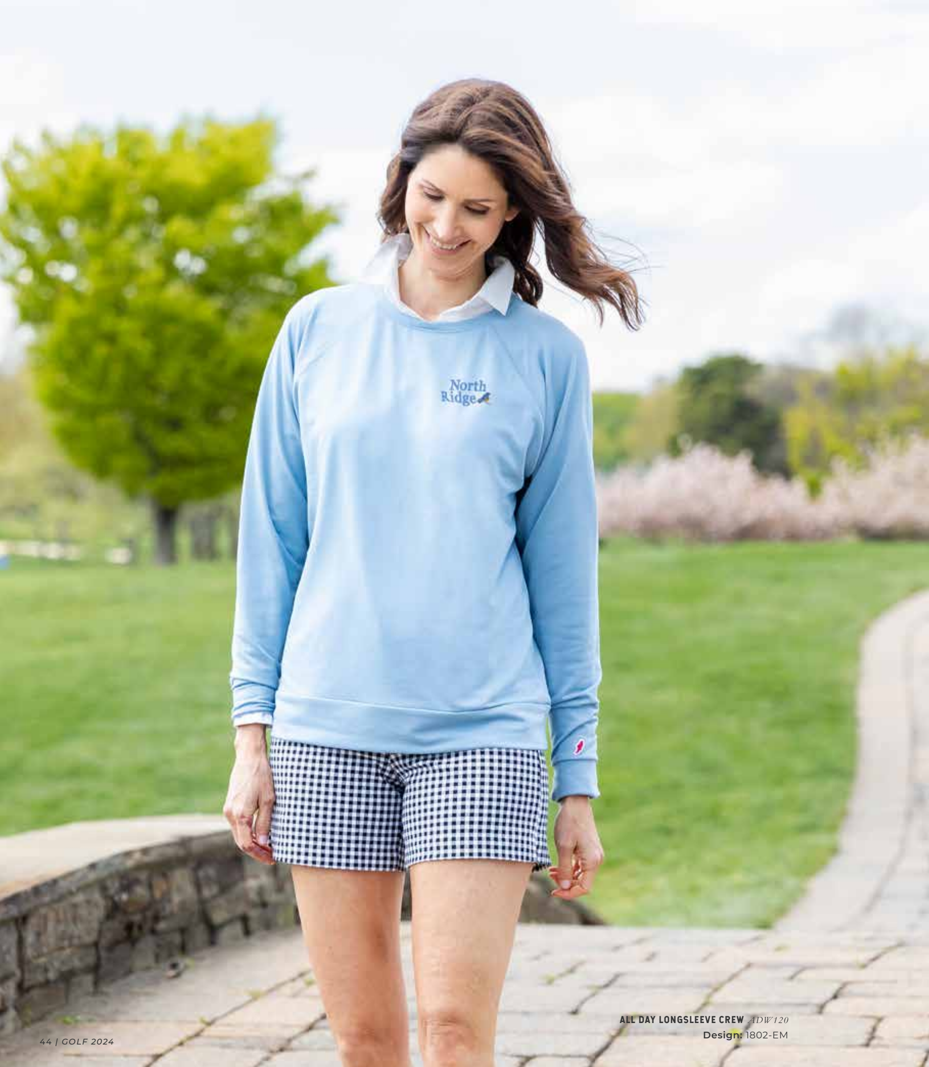
ALL DAY LONGSLEEVE CREW ADW120 Design: 1802-EM