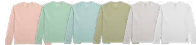
PINK SANDS PALE MINT SURF BLUE SAGE MIST SHELL WHITE

Available in XS-3XL: Shell White, Surf Blue, Pale Mint