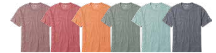
MAROON TRUE CARDINAL SUNSET HUNTER SEAFOAM FALL NAVY

Size Range: S-M-L-XL-2XL Design: 1220-SP