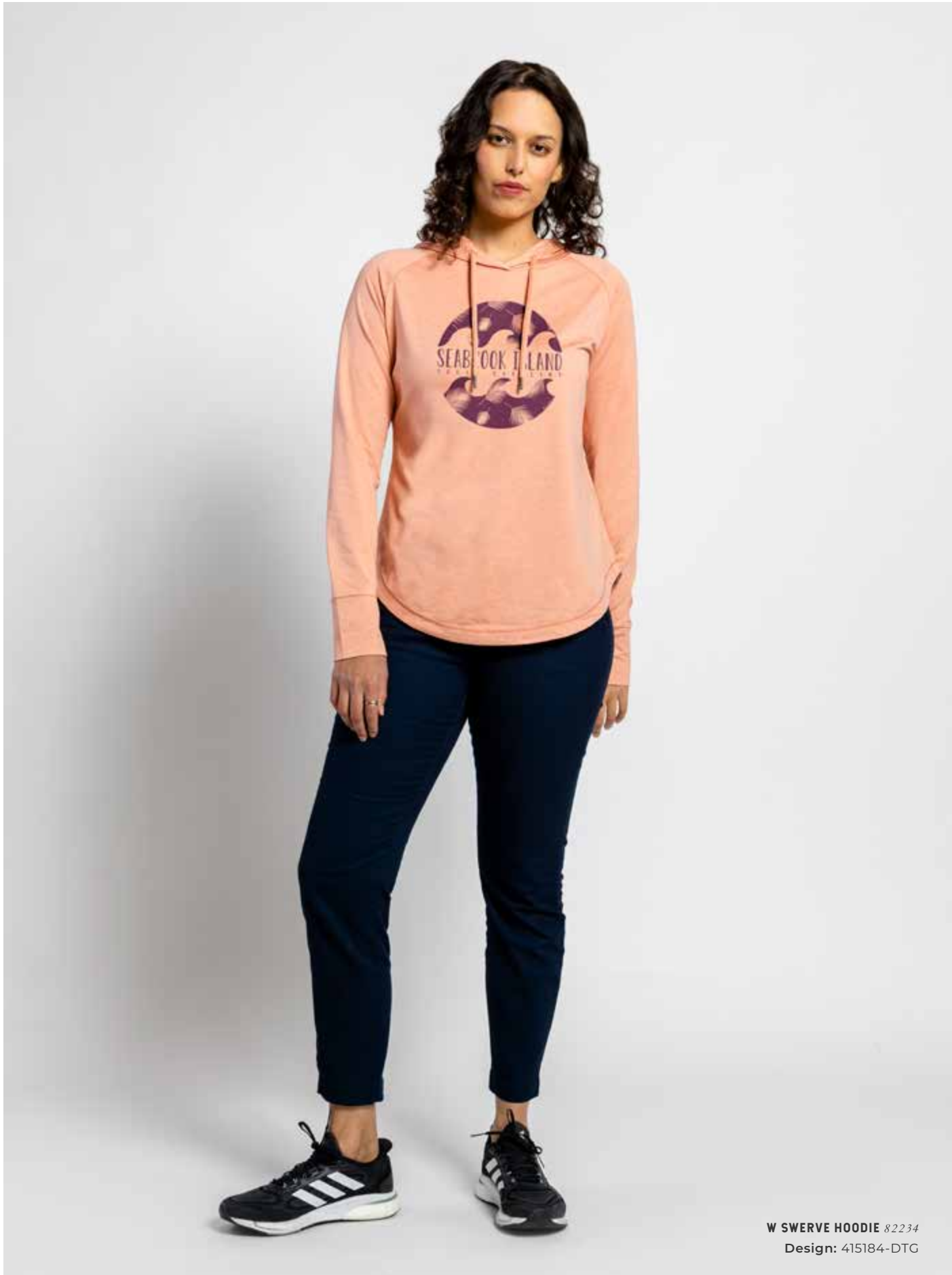
W SWERVE HOODIE 82234 Design: 415184-DTG