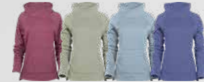
HAWTHORN ROSE HTR DESERT SAGE HTR BLUE FOG HTR BLEACHED DENIM HTR

Size Range: XS-S-M-L-XL-2XL Design: 324309-SP