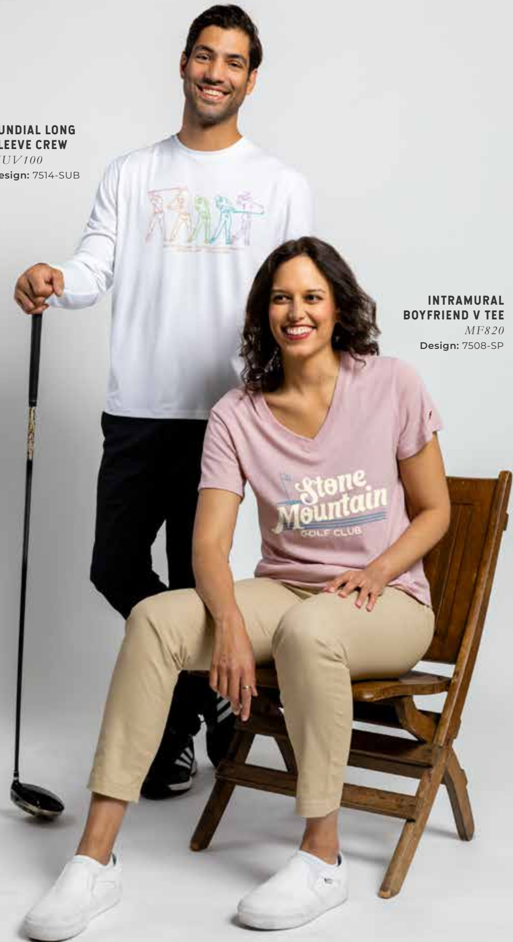
INTRAMURAL BOYFRIEND V TEE MF820 Design: 7508-SP