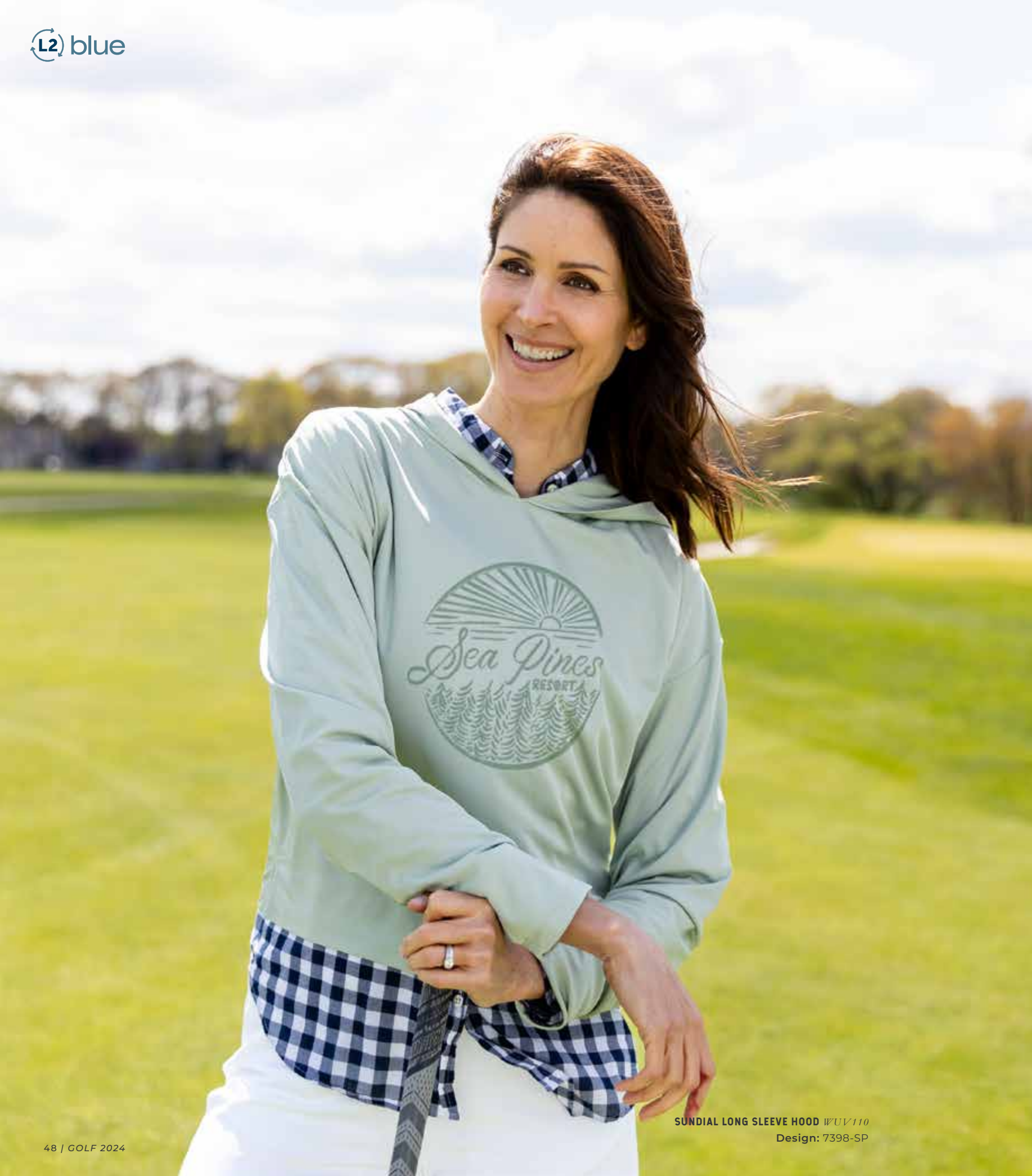
SUNDIAL LONG SLEEVE HOOD WUV110 Design: 7398-SP