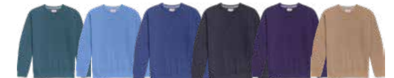
HTR SAPPHIRE HTR POWER BLUE HTR ROYAL BLUE HTR LIBERTY NAVY HTR NEW PURPLE HTR TAUPE