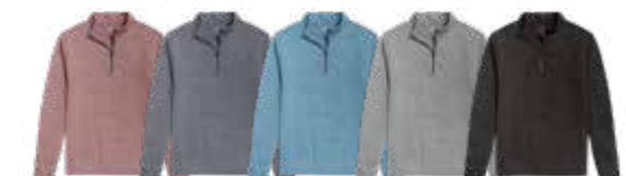
MAROON FALL NAVY MARINE BLUE GRAPHITE HEATHER TRUE BLACK

Size Range: S-M-L-XL-2XL Design: 339D-EM