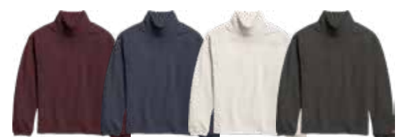
HTR MAROON HTR SPRING NAVY HTR DEW HTR SMOKE