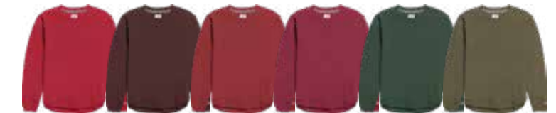
HTR VINTAGE RED HTR VARSITY MAROON HTR VINTAGE LIGHT MAROON HTR BERRY HTR HUNTER HTR OLIVE