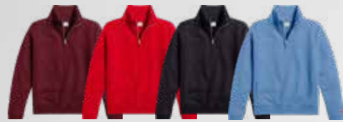
MAROON TRUE RED FALL NAVY POWER BLUE