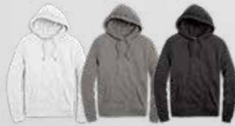
HTR VARSITY WHITE FALL HEATHER HTR ONYX