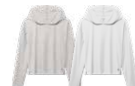
MIST SHELL WHITE