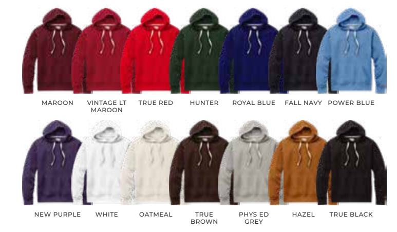
STADIUM CREW SF150 Design: 786B-SV

Size Range: S-M-L-XL-2XL Design: 6565-SP