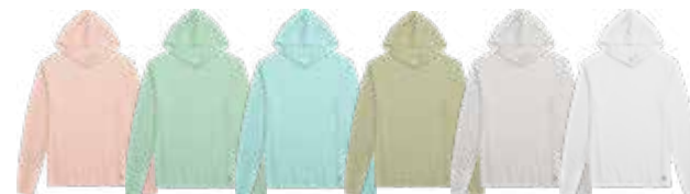
PINKS SANDS PALE MINT SURF BLUE SAGE MIST SHELL WHITE

Available in XS-3XL: Shell White, Surf Blue, Pale Mint