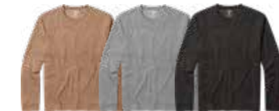
HAZEL GRAPHITE HEATHER TRUE BLACK