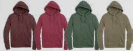
HTR VARSITY MAROON HTR BERRY HTR HUNTER HTR OLIVE

Size Range: S-M-L-XL-2XL Design: 7096-SP