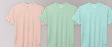
PINKS SANDS PALE MINT SURF BLUE