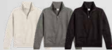
OATMEAL PHYS ED GREY TRUE BLACK