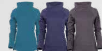
OCEAN DEPTHS HTR NAVY HTR CHARCOAL HTR