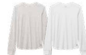
MIST SHELL WHITE