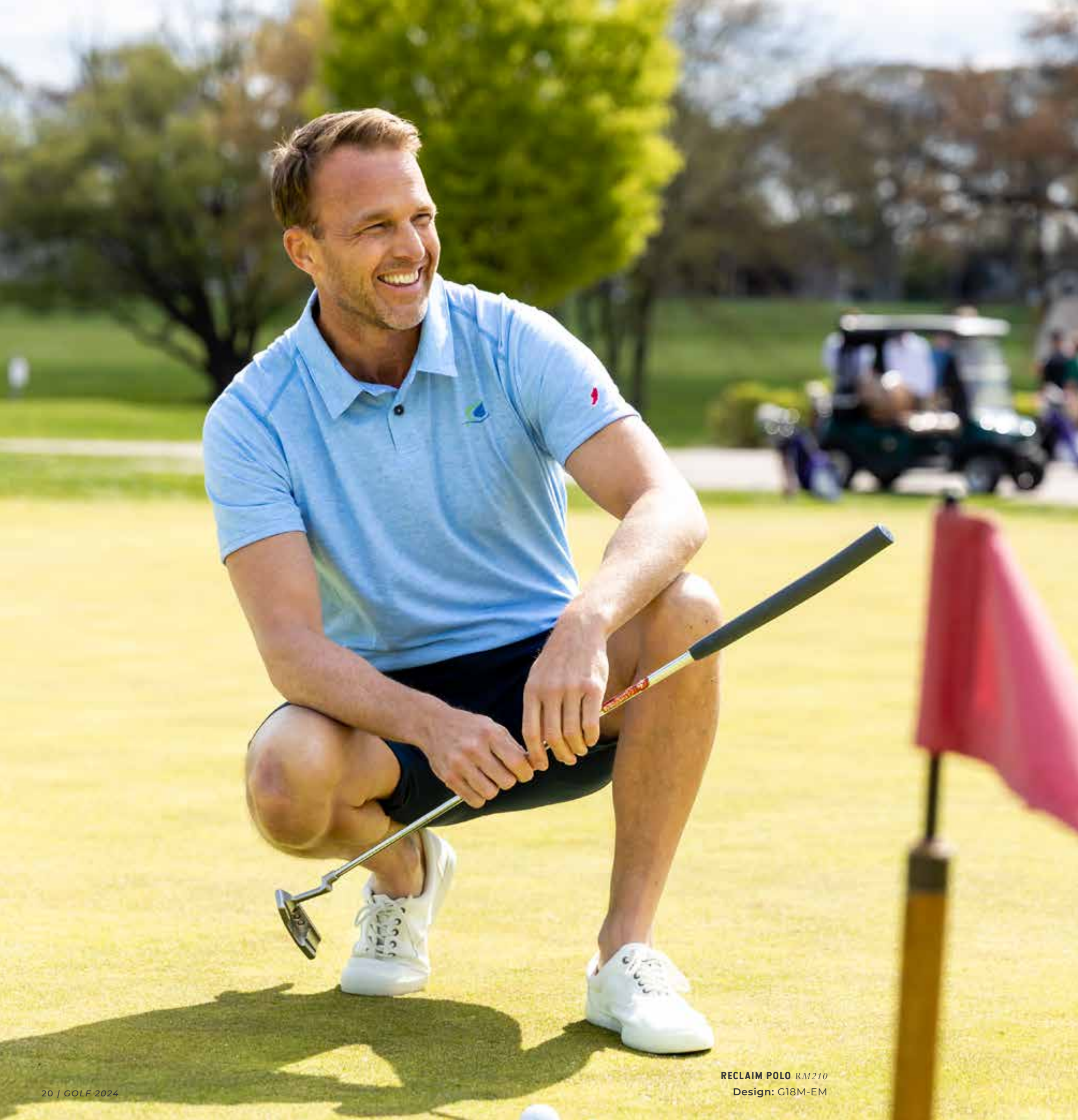
RECLAIM POLO RM210 Design: G18M-EM