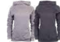
PREMIUM HTR CHARCOAL HTR