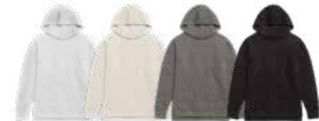
WHITE OATMEAL PHYS ED GREY TRUE BLACK