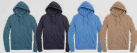
HTR SAPPHIRE HTR LIBERTY NAVY HTR POWER BLUE HTR TAUPE