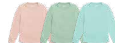
PINK SANDS PALE MINT SURF BLUE