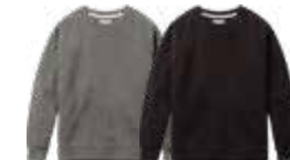
PHYS ED GREY TRUE BLACK

Available in 2XL and 3XL: Fall Navy, Oatmeal, True Black