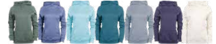
ATHLETIC HUNTER HTR BLEACHED DENIM HTR QUIET TIDE HTR OCEAN DEPTHS HTR BLUE FOG HTR NAVY HTR OATMEAL HTR