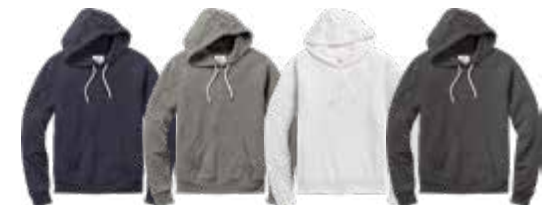
HTR LIBERTY NAVY FALL HEATHER HTR VARSITY WHITE HEATHER ONYX