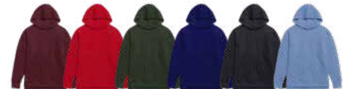
MAROON TRUE RED HUNTER ROYAL BLUE FALL NAVY POWER BLUE