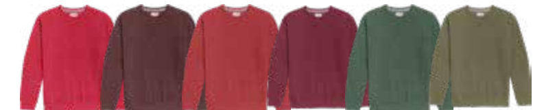
HTR VINTAGE RED HTR VARSITY MAROON HTR VT LT MAROON HTR BERRY HTR HUNTER HTR OLIVE