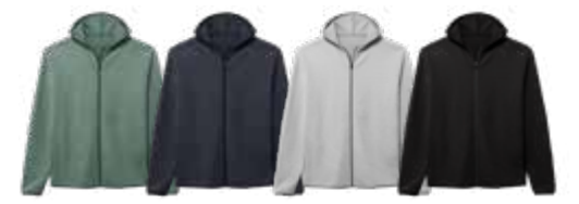
SPRUCE WASHED DARK NAVY MODERN GREY VINTAGE BLACK

Size Range: S-M-L-XL-2XL Design: 6865B-EM