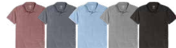
MAROON FALL NAVY POWER BLUE GRAPHITE HEATHER TRUE BLACK

Size Range: S-M-L-XL-2XL Design: 4042-EM