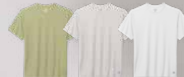
SAGE MIST SHELL WHITE