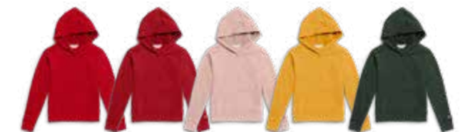
RED CARDINAL DUSTY ROSE HONEY DARK GREEN