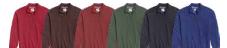
HTR VINTAGE RED HTR VARSITY MAROON HTR VT LIGHT MAROON HTR HUNTER HTR LIBERTY NAVY HEATHER ROYAL BLUE