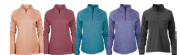
MUTED CLAY HTR HAWTHORN ROSE HTR OCEAN DEPTHS HTR PERIWINKLE HTR CHARCOAL HTR