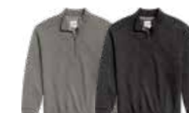
FALL HEATHER HTR ONYX