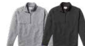
NIMBUS GREY CHARCOAL GREY