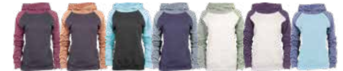
CHARCOAL HTR / HAWTHORN ROSE HTR CHARCOAL HTR / MUTED CLAY HTR CHARCOAL HTR / CARIBBEAN BLUE HTR NAVY HTR / BLUE FOG HTR OATMEAL HTR / DESERT SAGE HTR OATMEAL HTR / VINTAGE VIOLET HTR QUIET TIDE HTR / BLEACHED DENIM HTR

Size Range: XS-S-M-L-XL-2XL Design: 302539-SPM