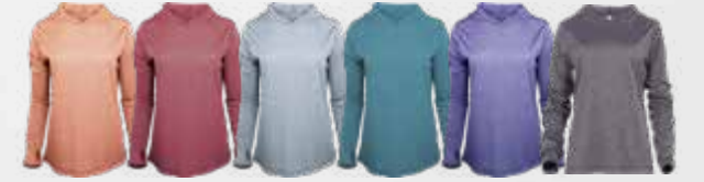
MUTED CLAY HTR HAWTHORN ROSE HTR BLUE FOG HTR OCEAN DEPTHS HTR PERIWINKLE HTR CHARCOAL HTR

Size Range: XS-S-M-L-XL-2XL Design: 391683-SP