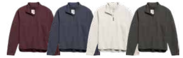
HTR MAROON HTR SPRING NAVY HTR DEW HTR SMOKE