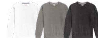
HTR VARSITY WHITE FALL HEATHER HTR ONYX