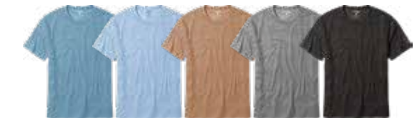
MARINE BLUE POWER BLUE HAZEL GRAPHITE HEATHER TRUE BLACK