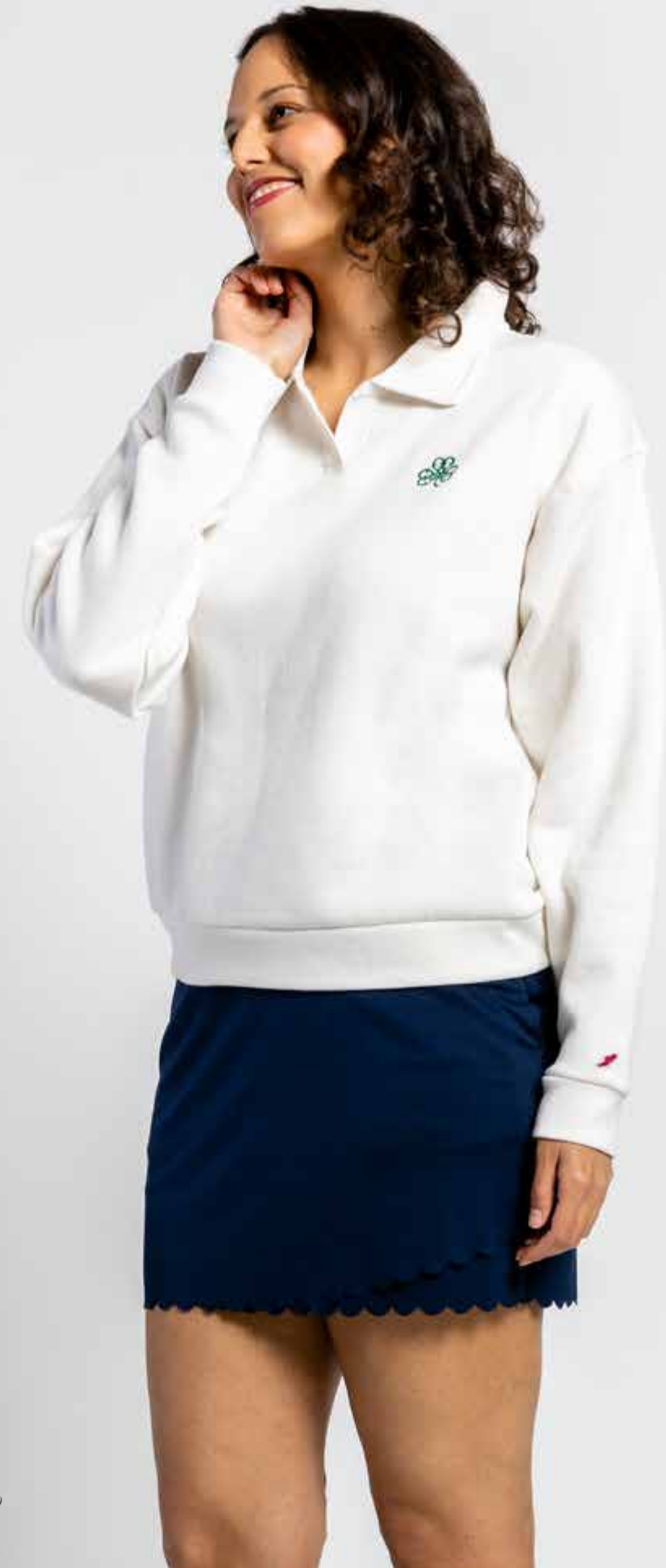
VICTORY SPRINGS COLLAR TR900 Design: G18M-EM

HTR VARSITY MAROON HTR LIBERTY NAVY HTR VARSITY WHITE FALL HEATHER HTR ONYX