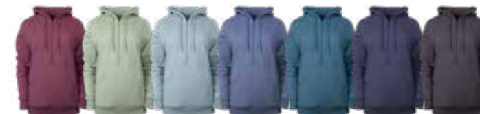
HAWTHORN ROSE HTR DESERT SAGE HTR BLUE FOG HTR BLEACHED DENIM HTR OCEAN DEPTHS HTR NAVY HTR CHARCOAL HEATHER

Size Range: XS-S-M-L-XL-2XL Design: G18-EM