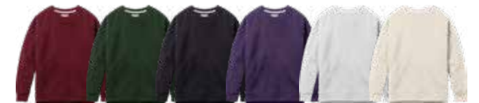
MAROON HUNTER FALL NAVY NEW PURPLE WHITE OATMEAL