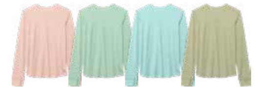
PINKS SANDS PALE MINT SURF BLUE SAGE