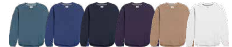
HTR SAPPHIRE HTR ROYAL BLUE HTR LIBERTY NAVY HTR NEW PURPLE HTR TAUPE HTR VARSITY WHITE