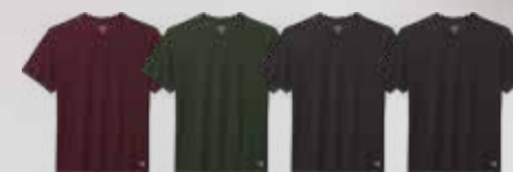
MAROON HUNTER FALL NAVY TRUE BLACK