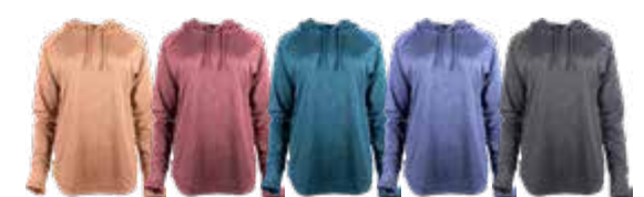
MUTED CLAY HTR HAWTHORN ROSE HTR OCEAN DEPTHS HTR PERIWINKLE HTR CHARCOAL HTR